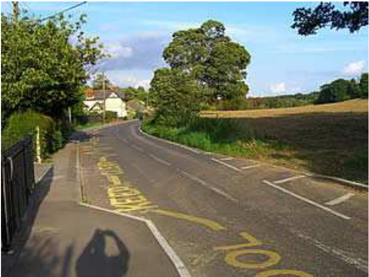
Typical build out arrangement with no signage.

On the mainland this would include advance signing and signing to indicate which direction has priority. However in the interests of the principles set out in the design guide and the CSUS it is envisaged that a less formal arrangement could be used with a gentle widening of the existing footway reducing the road width to 3.5m over no more than 5m length. This would also provide a little extra footway over short sections. The second build out could be achieved as low level paving. An illustration of this approach is shown below, which has minimal signing/markings.