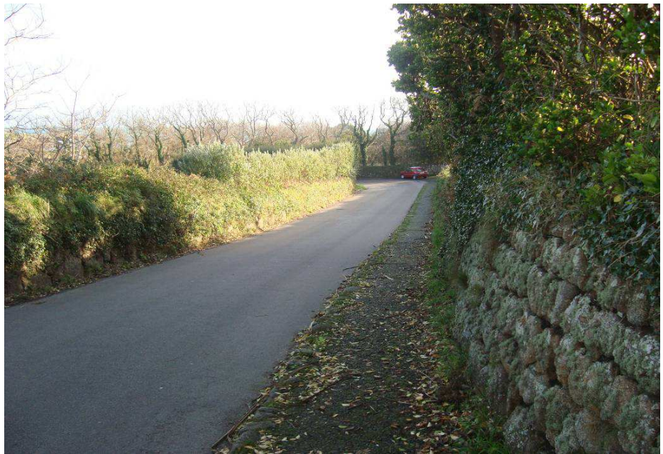
Old Town Road

Old Town Road is narrow at that point with a narrow footway on the north side, the school side.