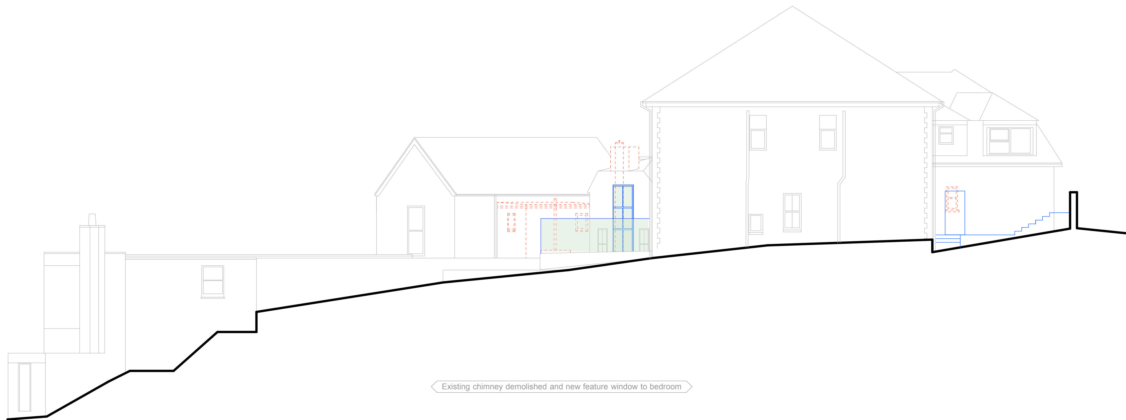
Elevation from the top of Garrison Hill

Existing chimney demolished and new feature window to bedroom