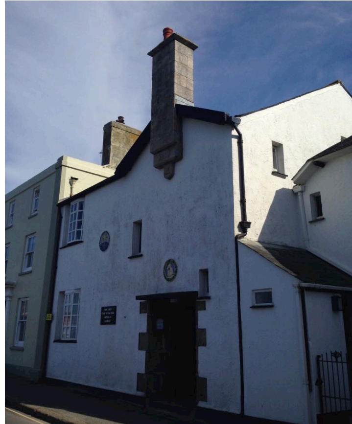
White rendered facade with exposed stone detailing

Hugh Town vernacular detailing that informed the design concept