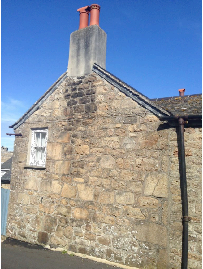
Local stone gable ends