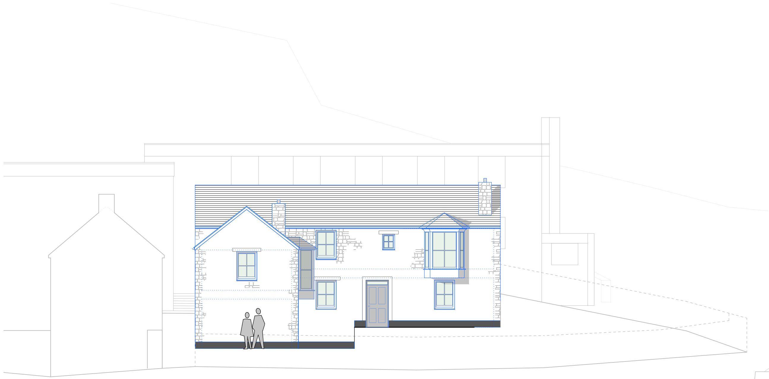
Garden Cottages - North East Elevation