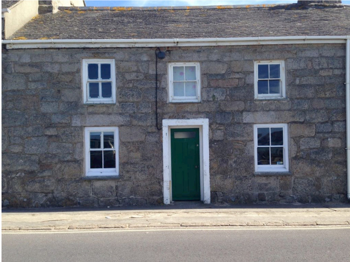
Local stone cottages with white window and door reveals and brightly coloured doors