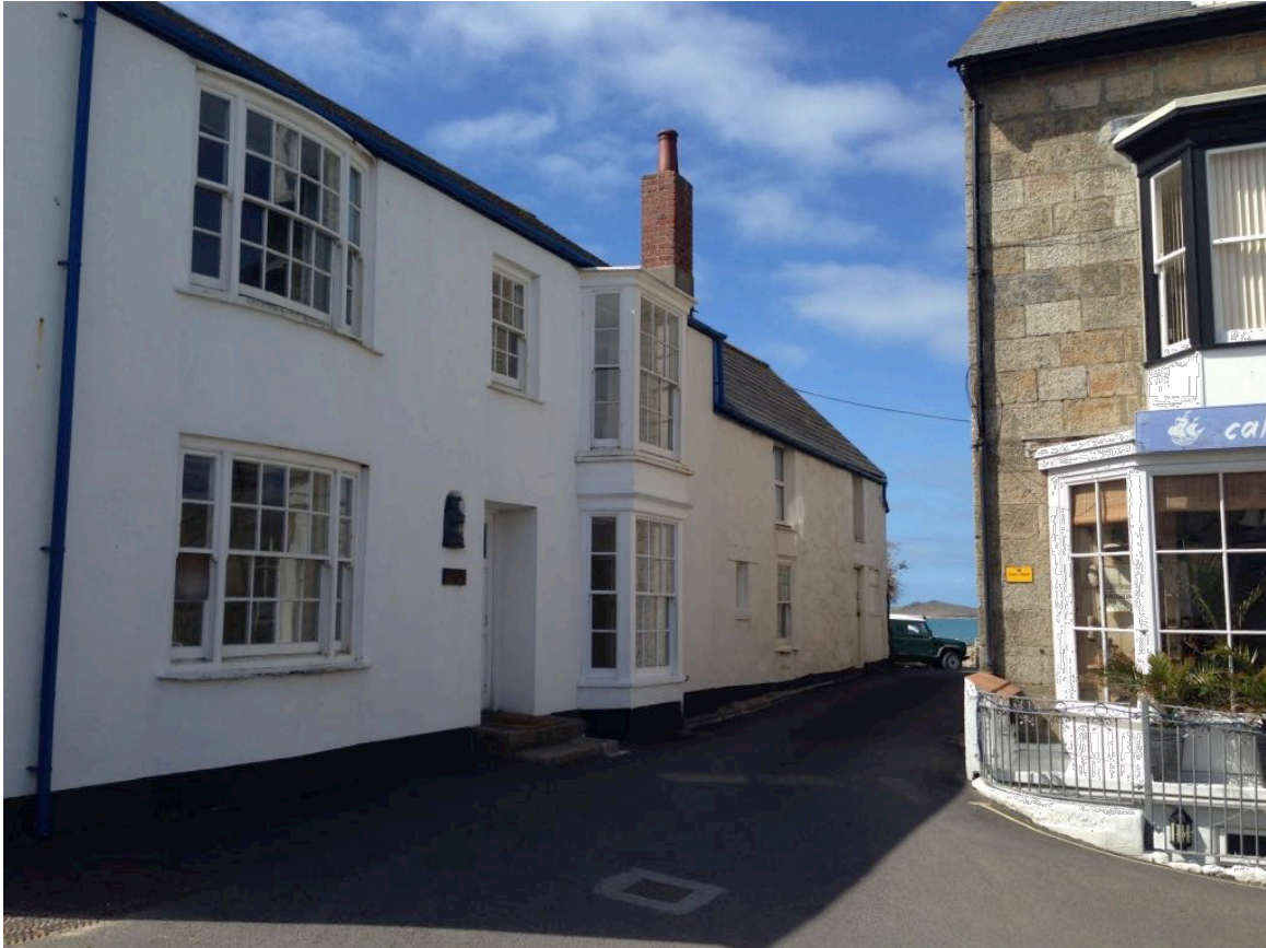
Rendered terraced cottages with bay windows and natural slate roofs