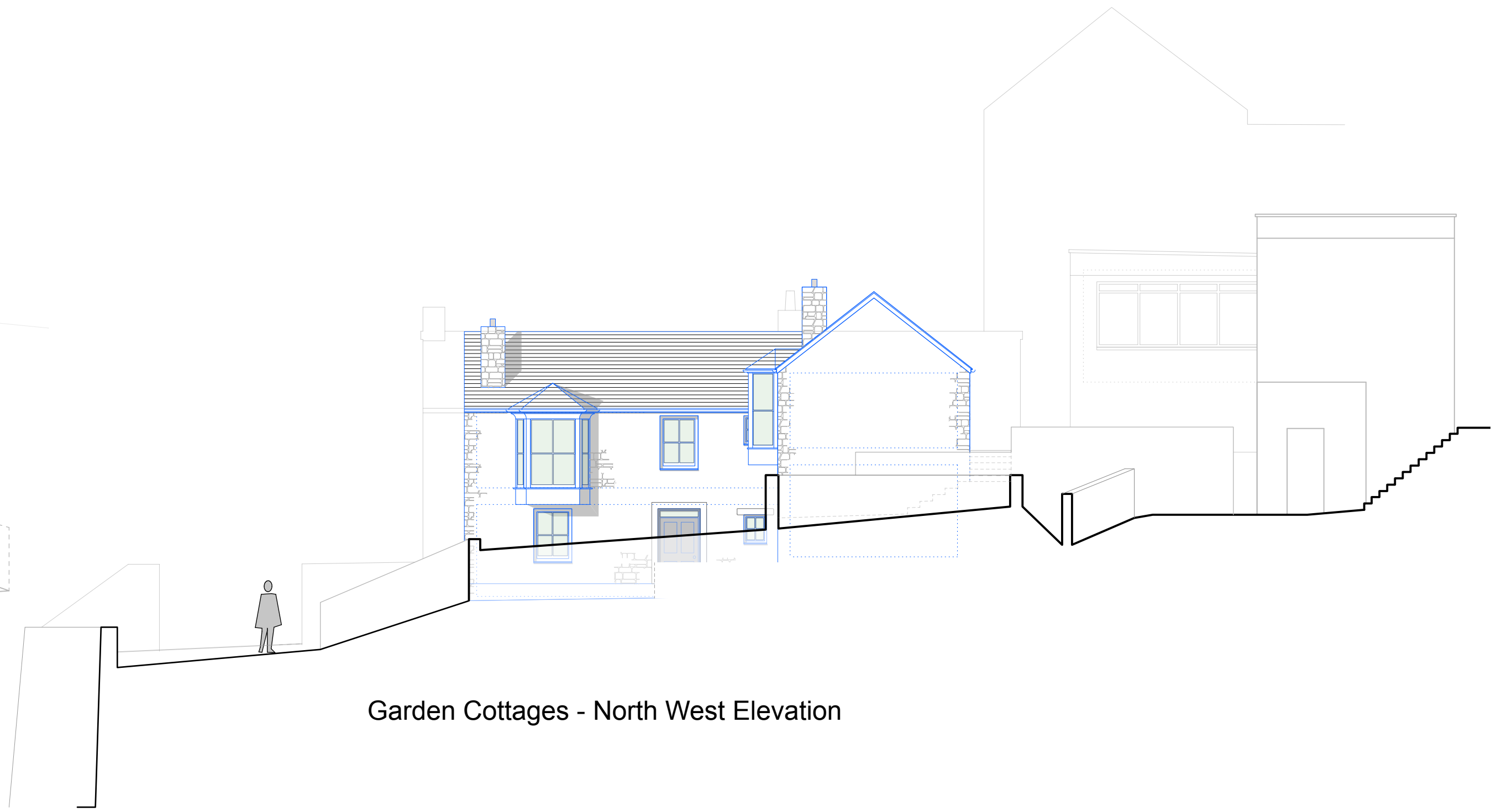
Garden Cottages - North West Elevation