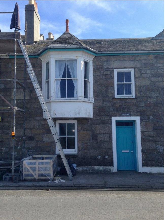
Bay windows breaking the roof line