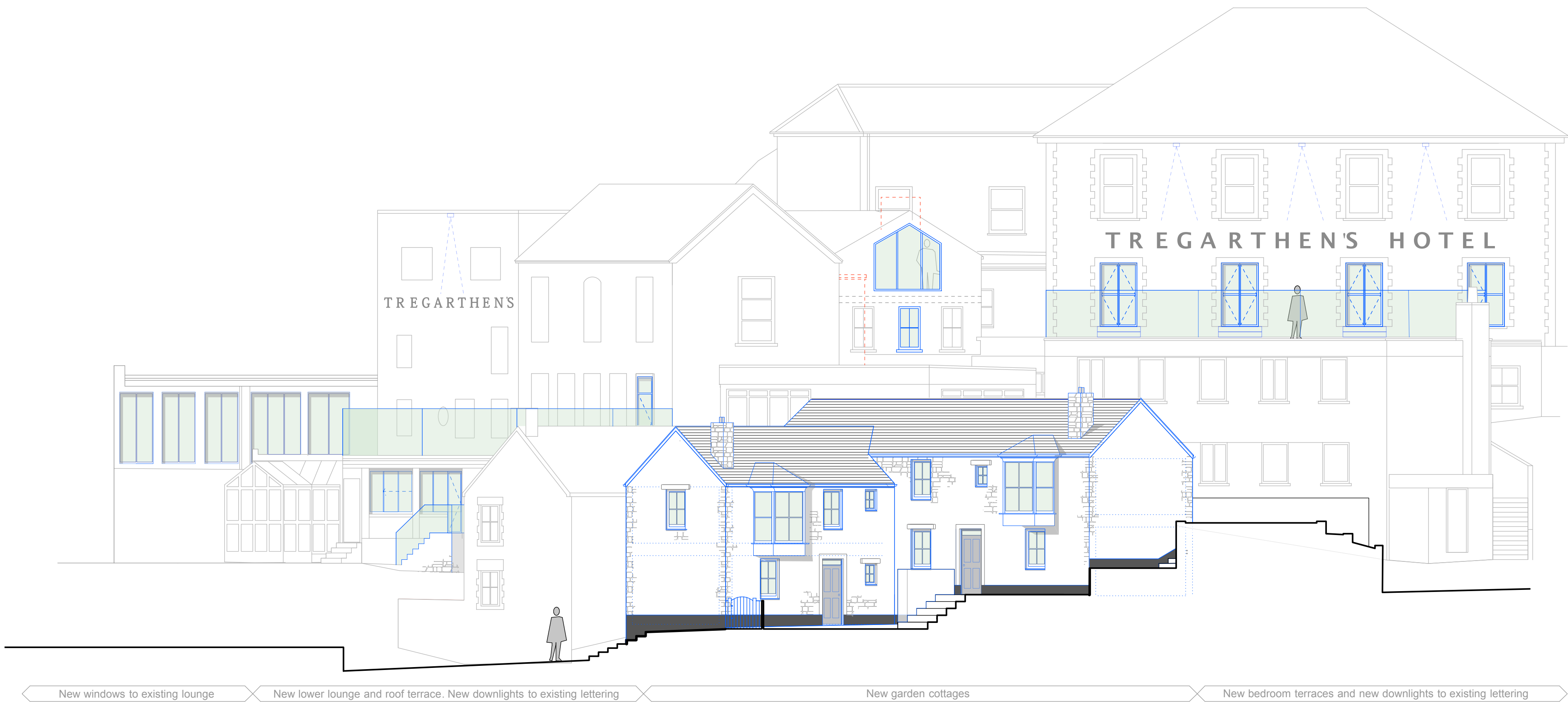
Proposed Hotel and Garden Cottages Elevation