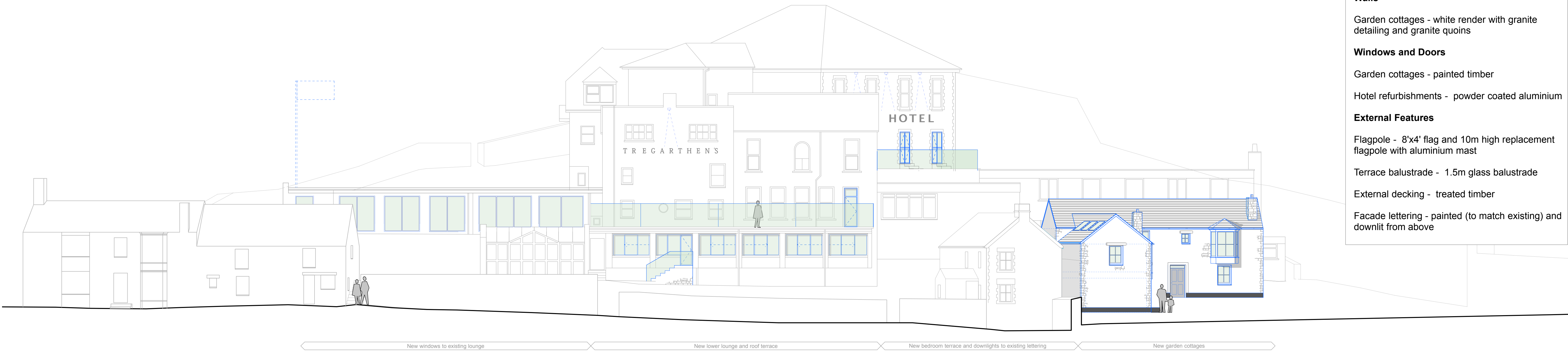
Proposed Hotel and Garden Cottages Waterside Elevation