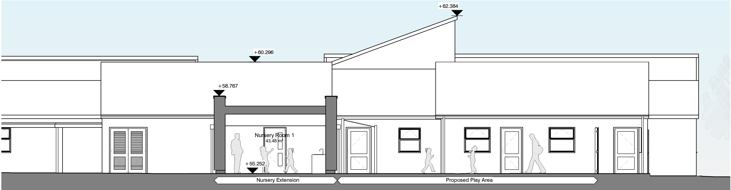
Proposed Section 2 1 : 100