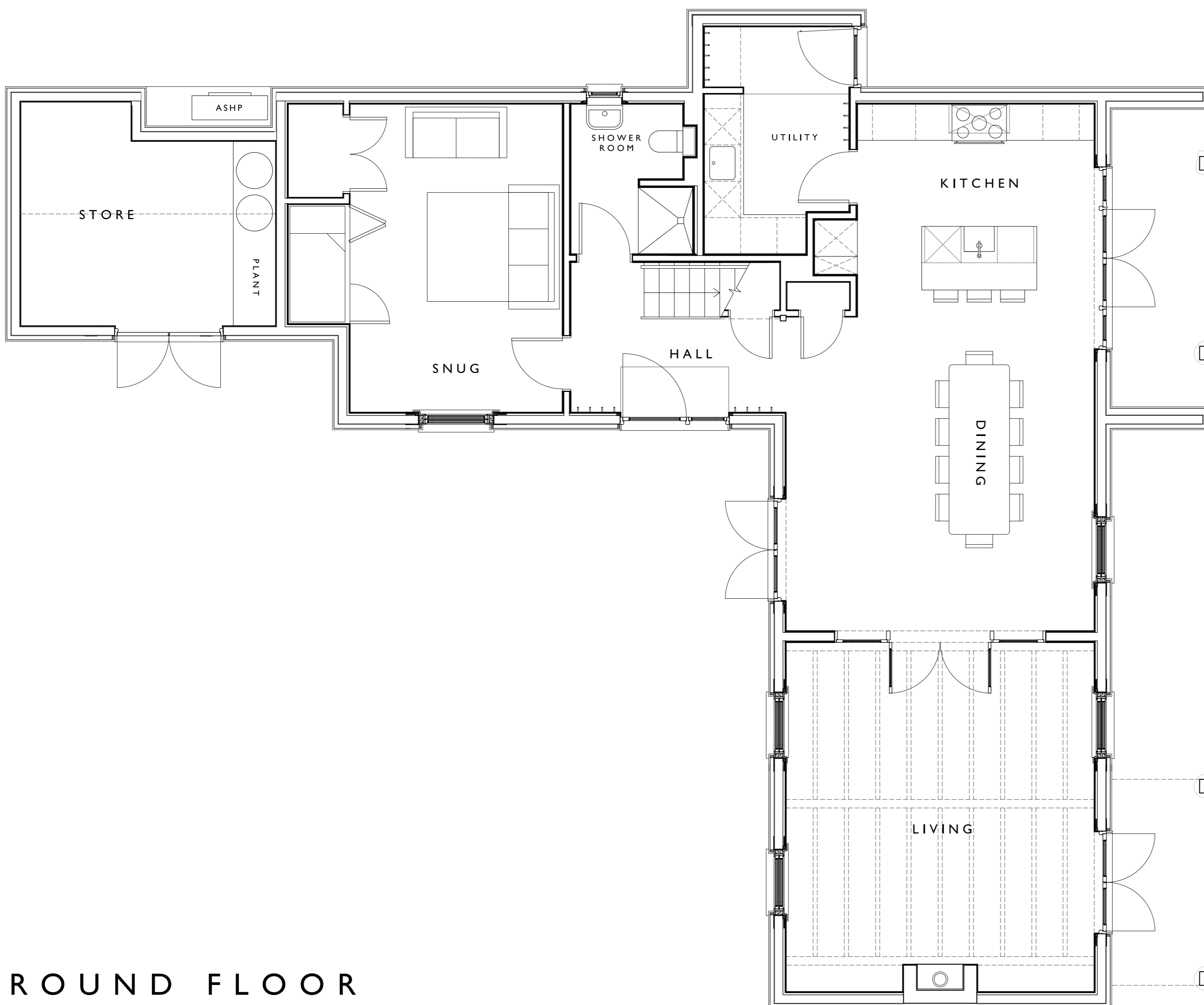
GROUND FLOOR 1:50 @ A1