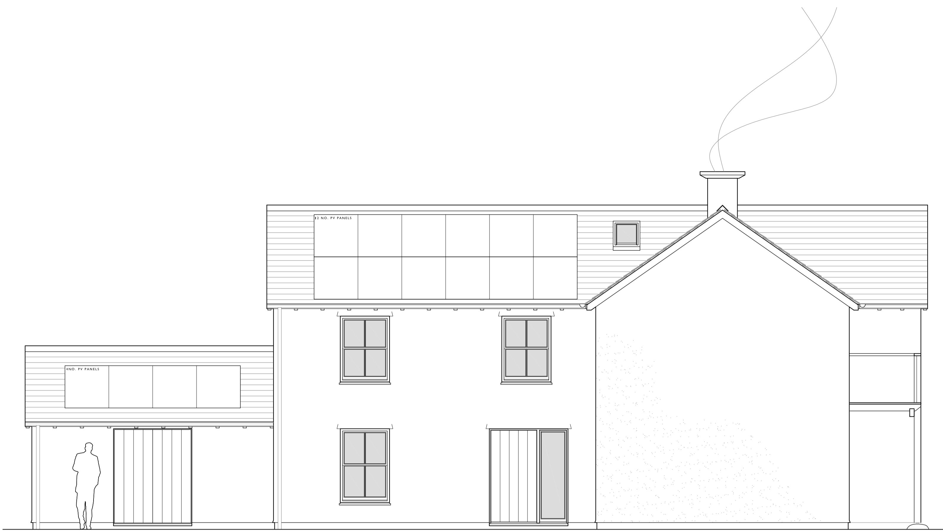
SOUTH ELEVATION PROPOSED