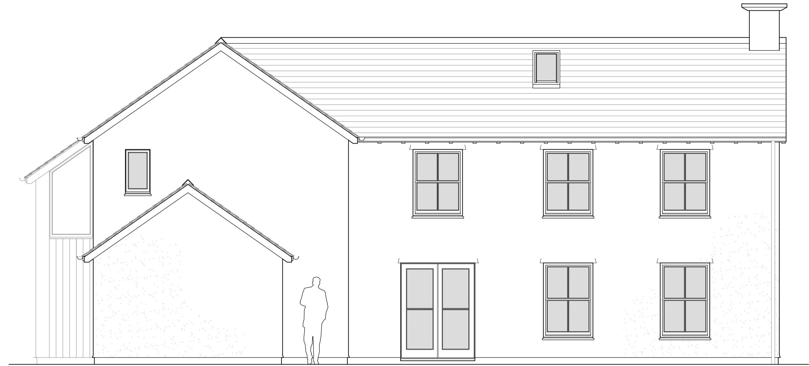
WEST ELEVATION PROPOSED