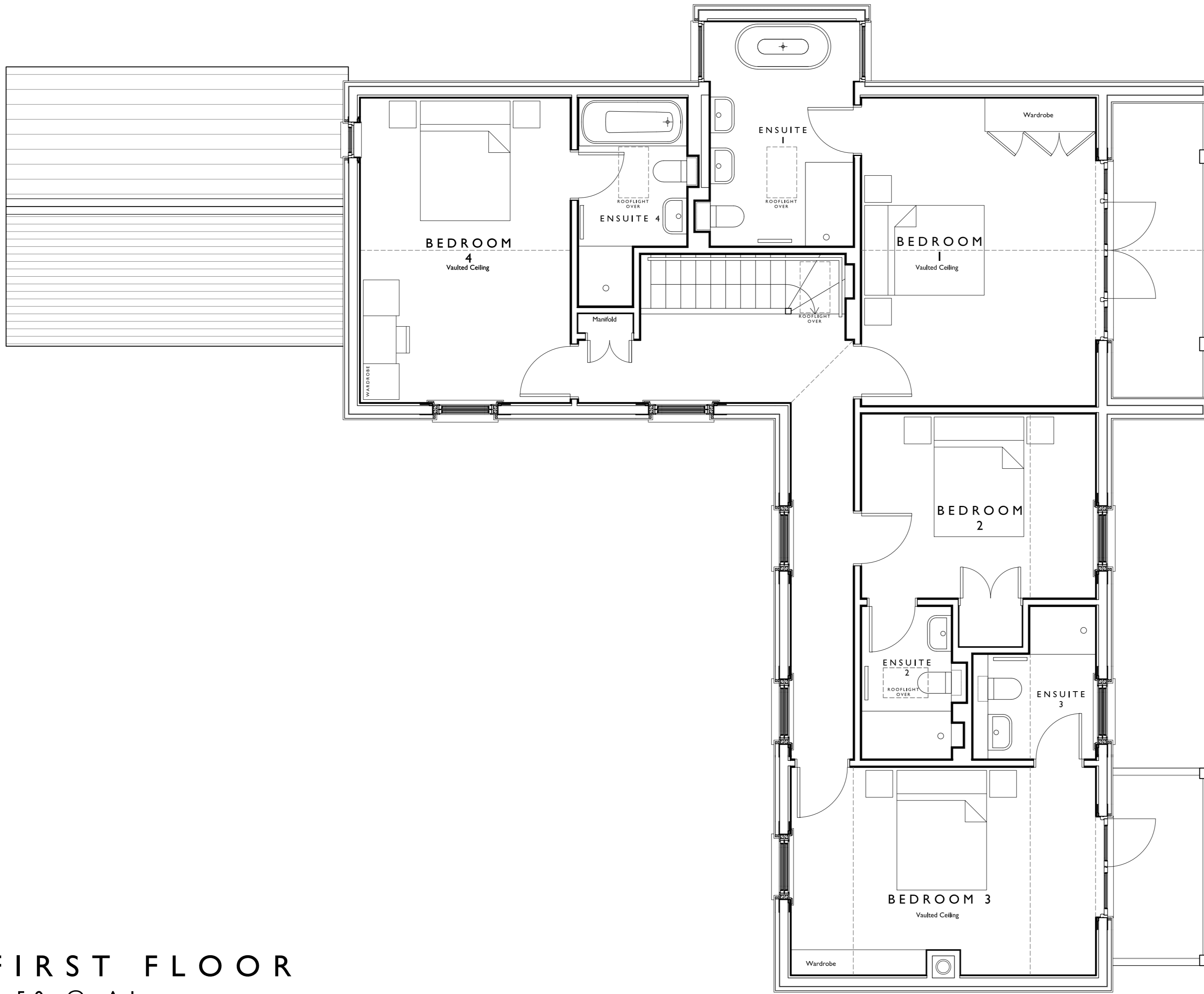
FIRST FLOOR 1:50 @ A1

APPROVED By Craig Dryden at 3:17 pm, Jul 29, 2019