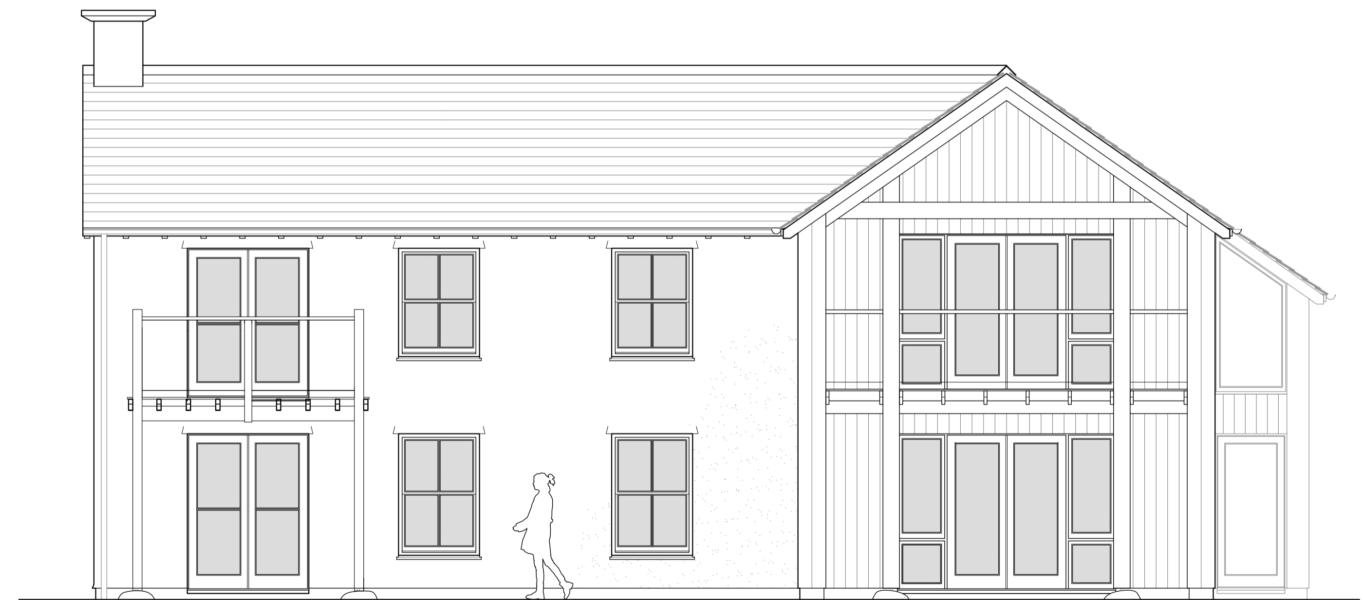
EAST ELEVATION PROPOSED