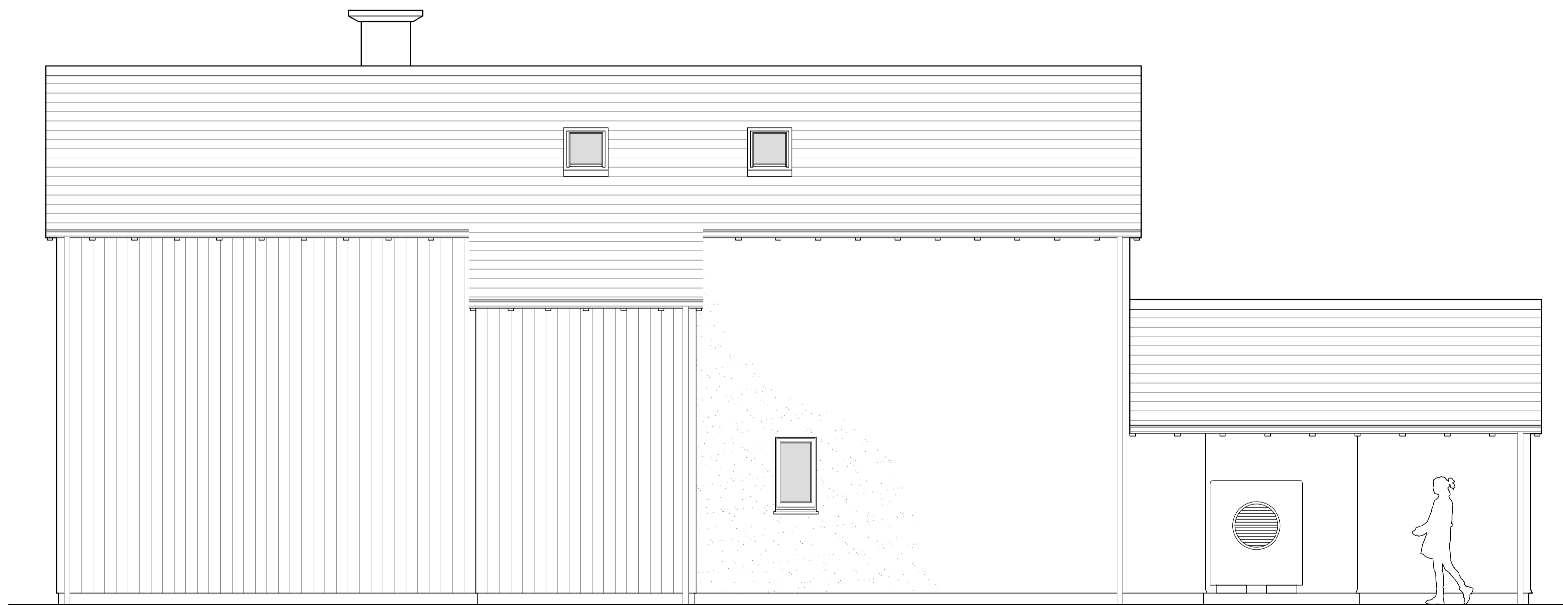
NORTH ELEVATION PROPOSED