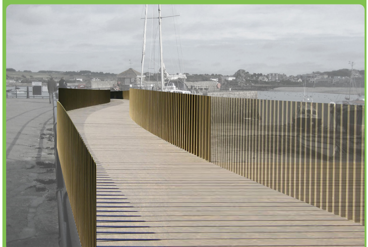
Improved pedestrian access, St Mary's Quay (Illustrative design)