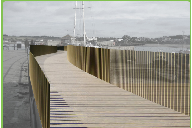
Improved pedestrian access, St Mary's Quay (Illustrative design)