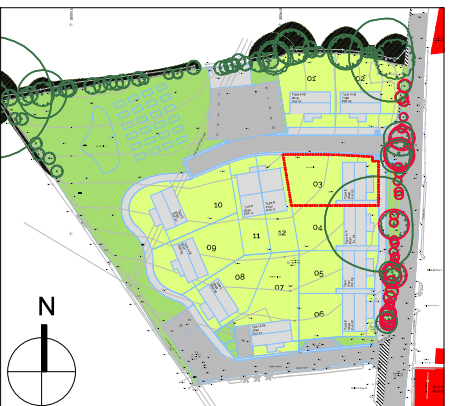
Site Plan (not to scale)

Owners to take bins to collection point as marked on estate Site Plan