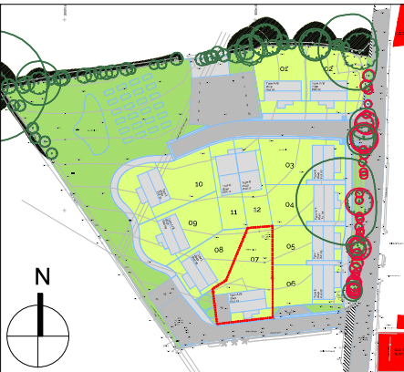
Site Plan (not to scale)