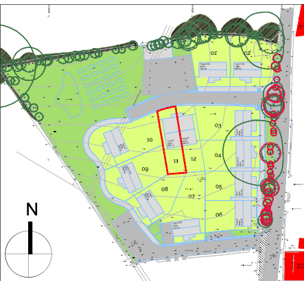
Site Plan (not to scale)

*Position will be dictated by back edge of curb from footpath