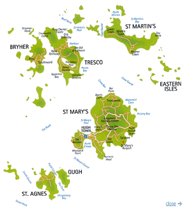
Fig 1 – Map of the Isles of Scilly

1.10 The Isles of Scilly are connected to the mainland UK, and the wider economy, through air links with Lands End, Newquay and Exeter and sea links with Penzance. These links are vital for the economy of the islands and for the long term sustainability of the islands' community. The air links are responsible for around 65% of passenger transport whilst the majority of the 14,000 metric tonnes of freight per annum required to sustain businesses and the community are delivered by sea.