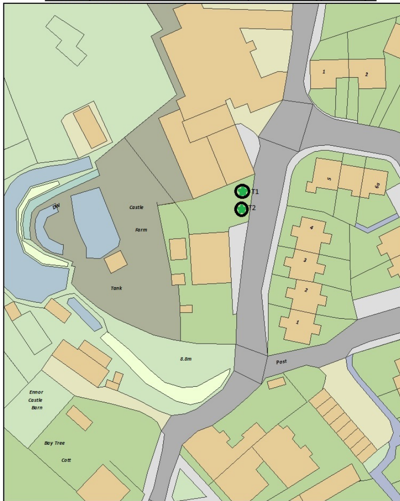
TPO T01/18 x2 Elm Trees at Old Town (The Distillery) St Mary's