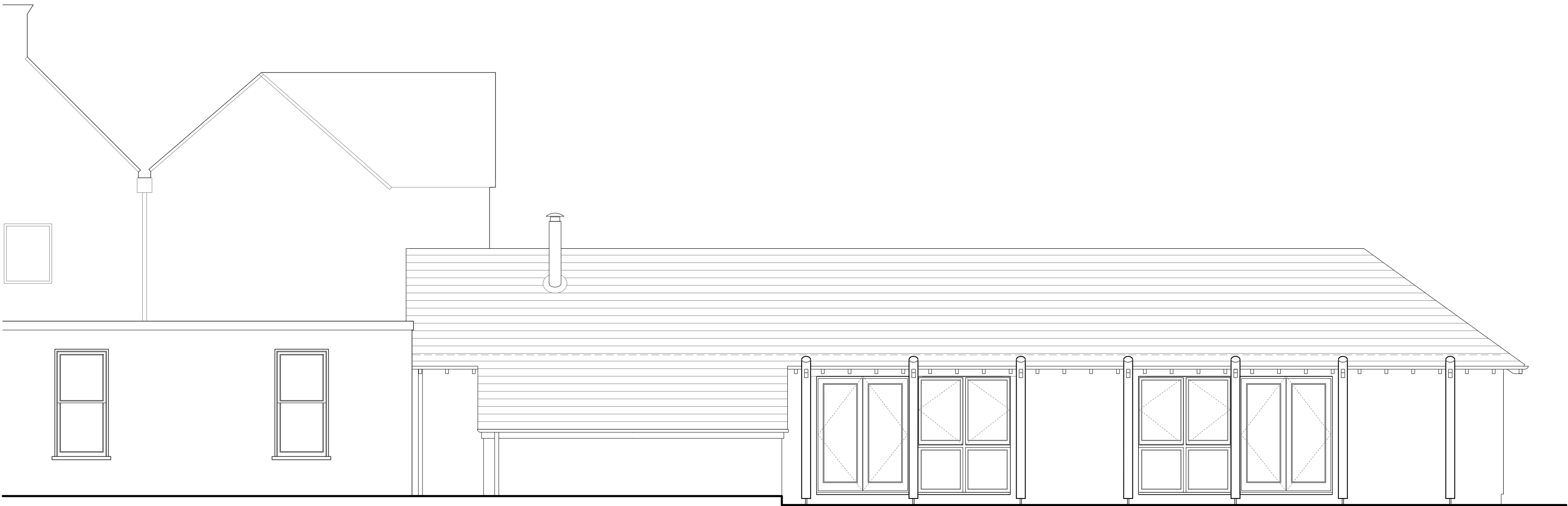
Proposed North-West Elevation