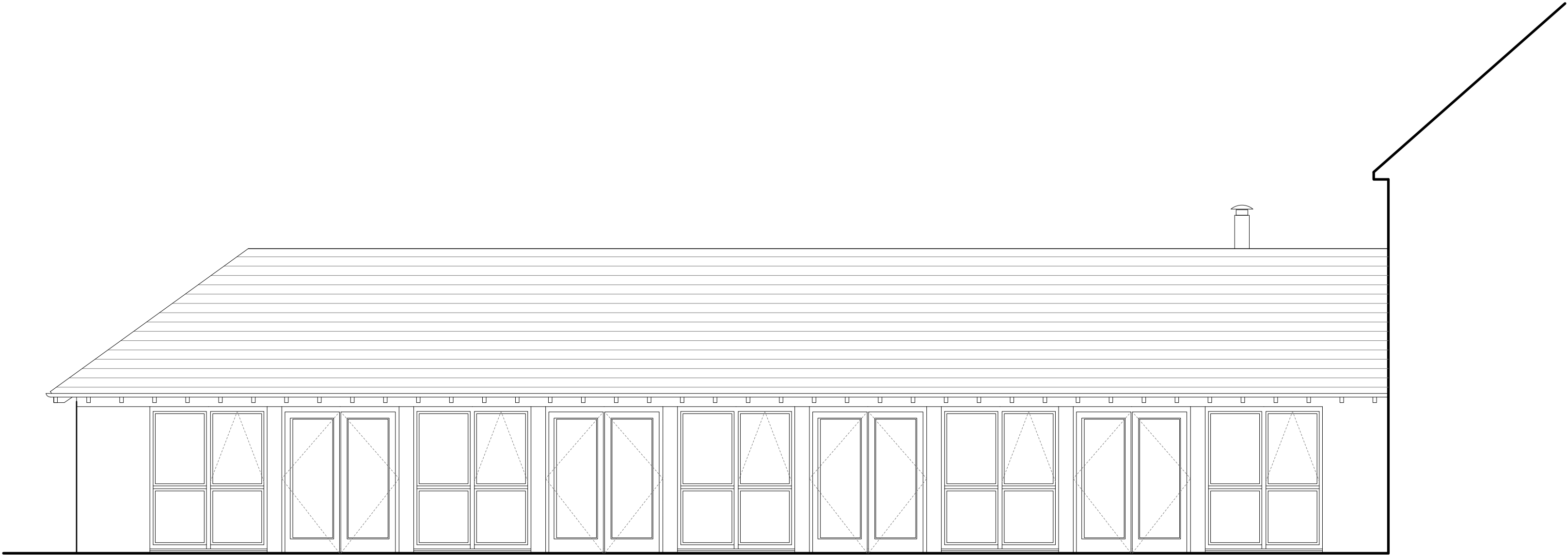
Proposed South-East Elevation