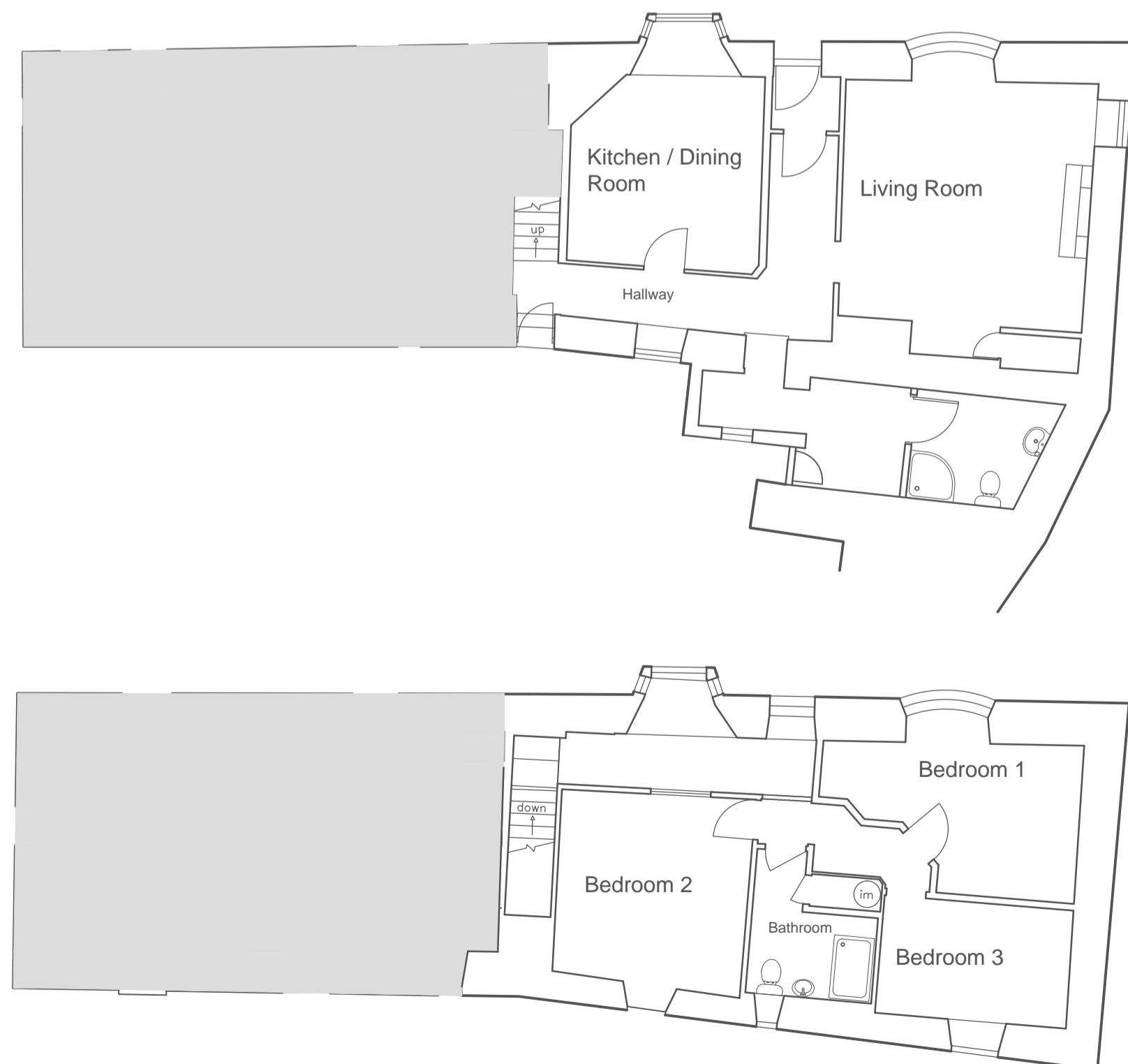
Floor Plans as Proposed @ 1:100