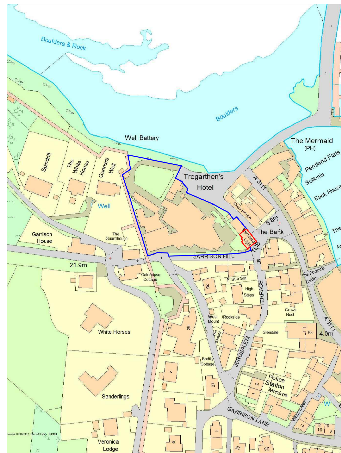
Location Plan @ 1:1250