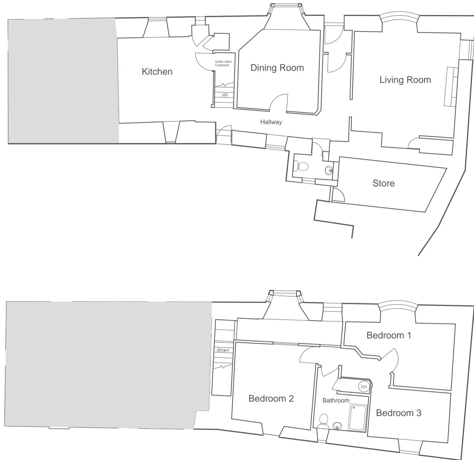
Floor Plans as Existing @ 1:100