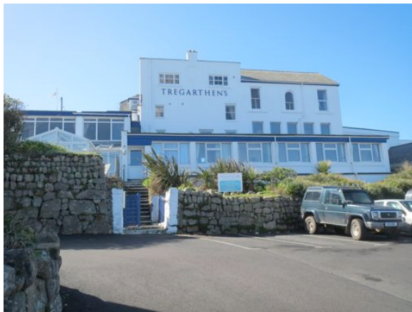
Photograph 1. Front (north) elevation of Tregarthens Hotel

Each of the habitats recorded during the Phase 1 Habitat Survey are described below. The dominant species recorded within each habitat are given together with any notable floral species observed.