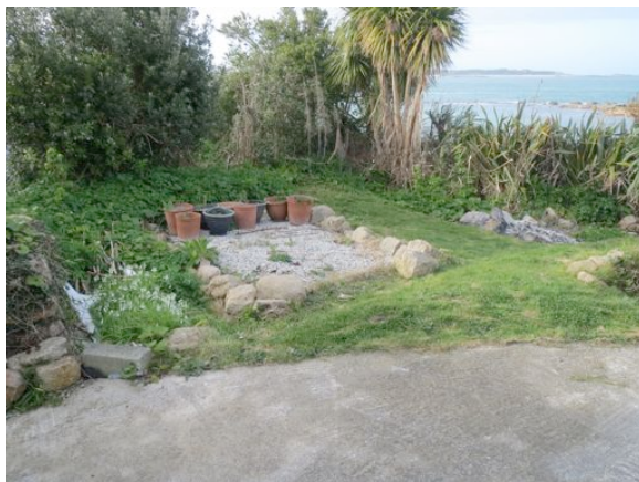
Photograph 2. Kitchen garden

The garden areas associated with the hotel are very small in extent. There are areas of lawn with perennial ryegrass, common bent grass, cock's-foot, daisy, white clover, common cat's-ear and ribwort plantain. The borders and flowerbeds support kitchen herbs and garden plants that are mostly non-native and common in the residential gardens of the island, including Phormia sp., Agapanthus , Echium sp. and acaves. Native species include alexander's and butterbur. No plant species of biodiversity value were observed within the gardens. The garden areas of the hotel are not considered to have notable biodiversity value.