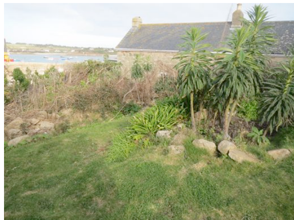
Photograph 3. Lawn and gardens