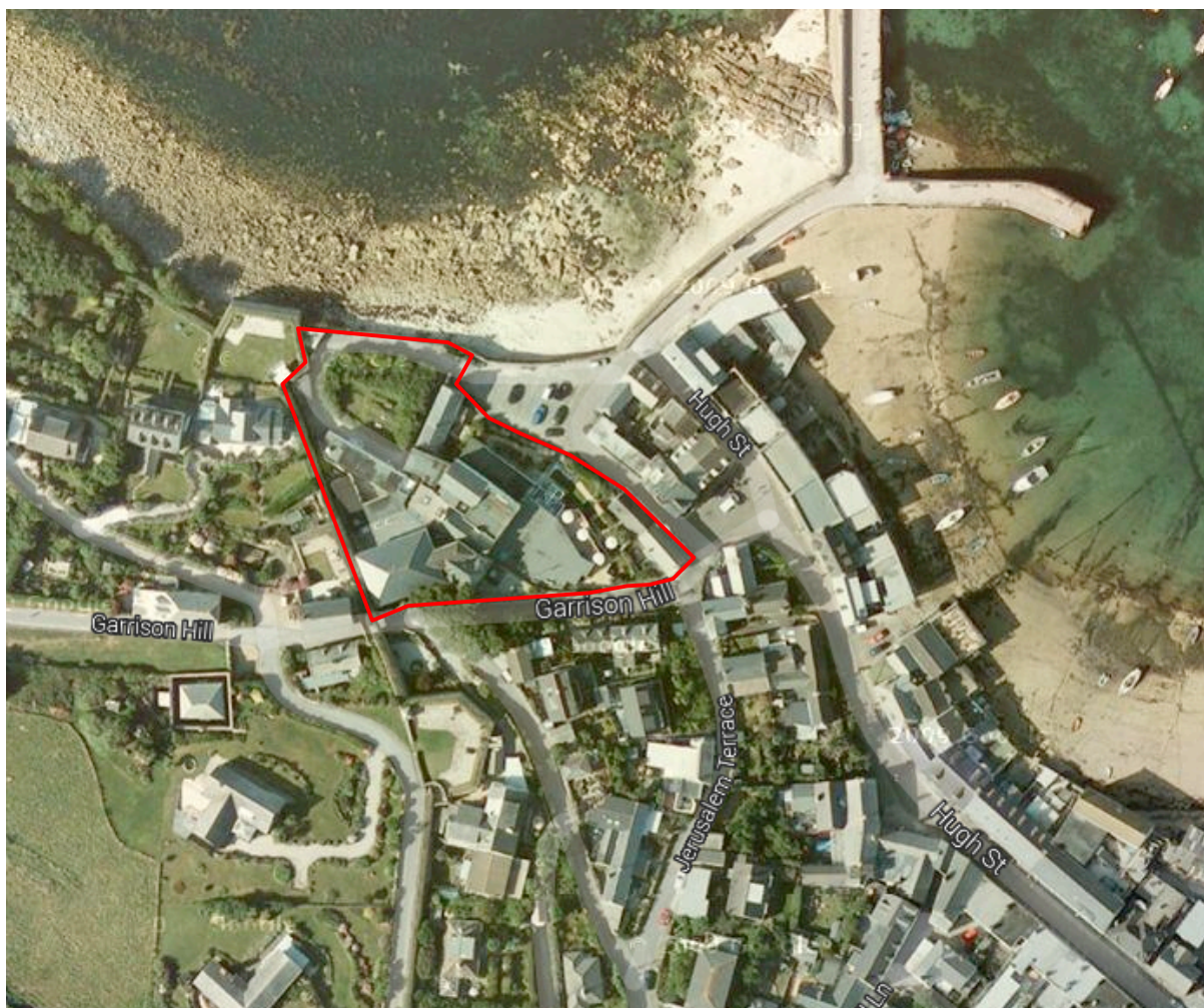
Figure 1. Aerial photograph (from Google maps 2015) showing survey area (location of the site is shown on Map 1 at the end of this report).