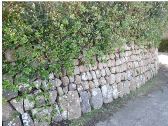
Photographs 4 & 5. Stone walls either side of access road on northern boundary