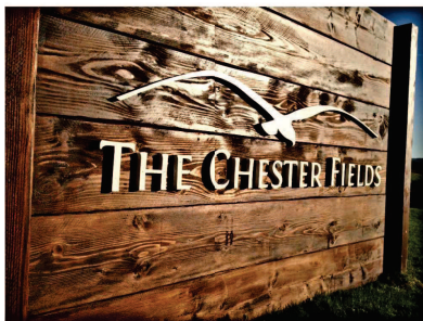
550x110mm slats Single Sided