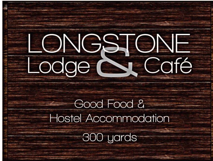
Top Panel 800x600mm

Side Profile 10mm marine ply, 25mm slats, 10mm white acrylic flat stuck