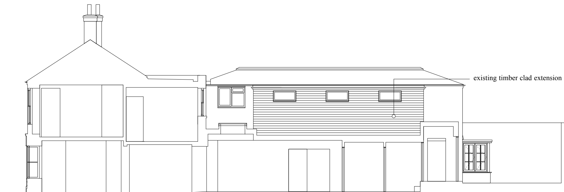
SIDE ELEVATION : SECTION C-C