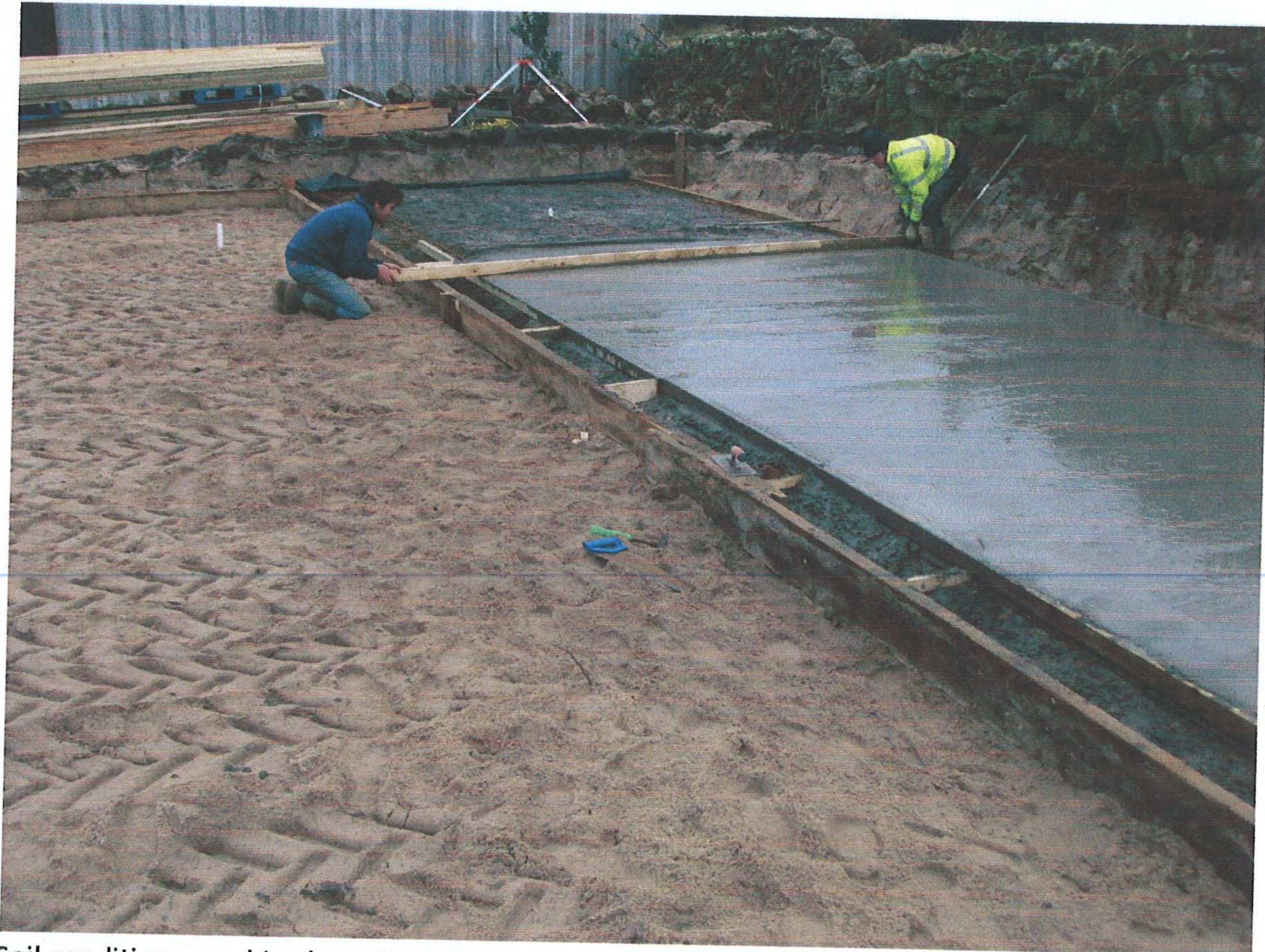
Soil conditions on chip shop site 2009