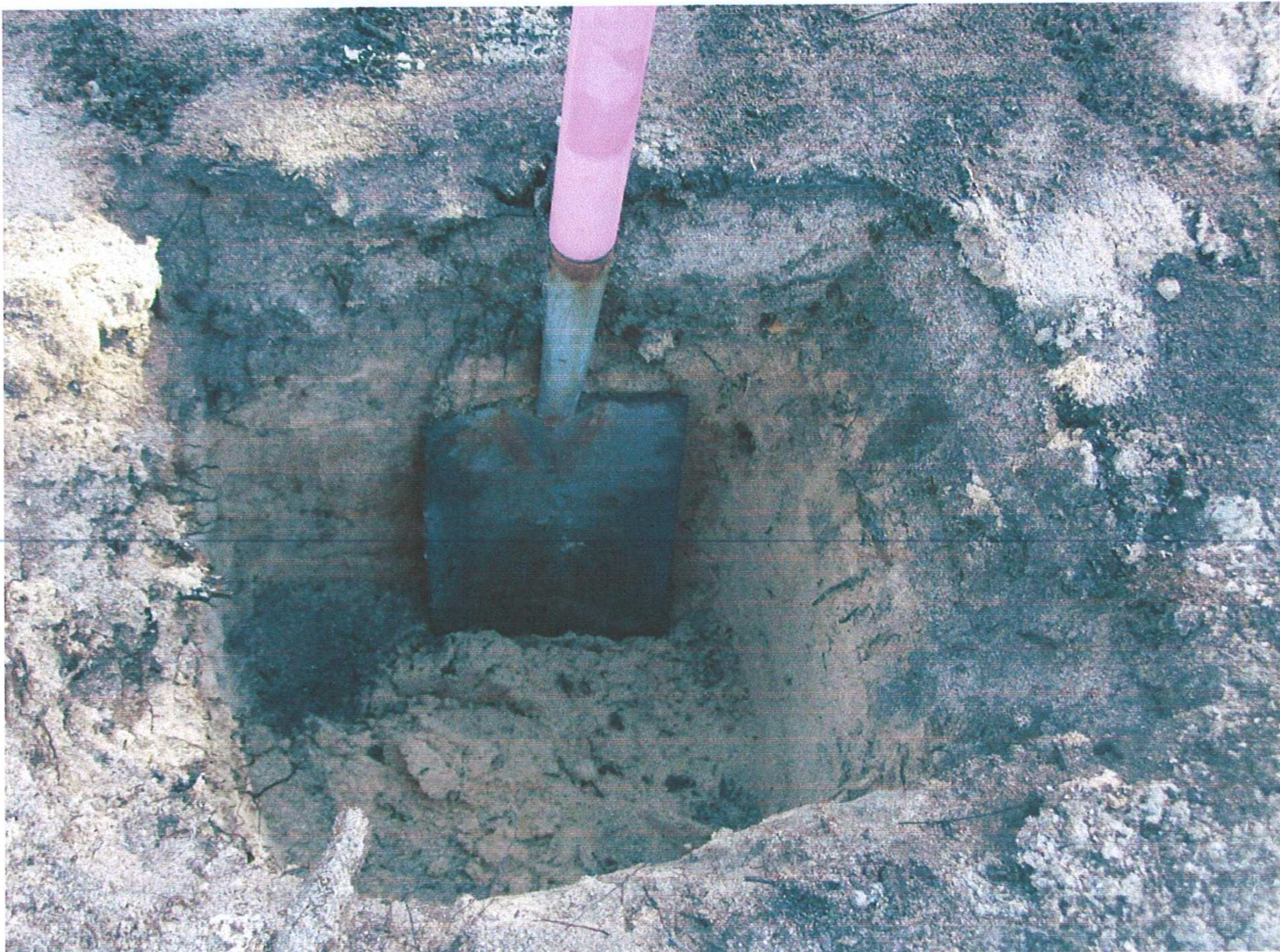
Sample of soil on site (same as chip shop site)

RECEIVED BY THE PLANNING DEPARTMENT 11 OCT 2017