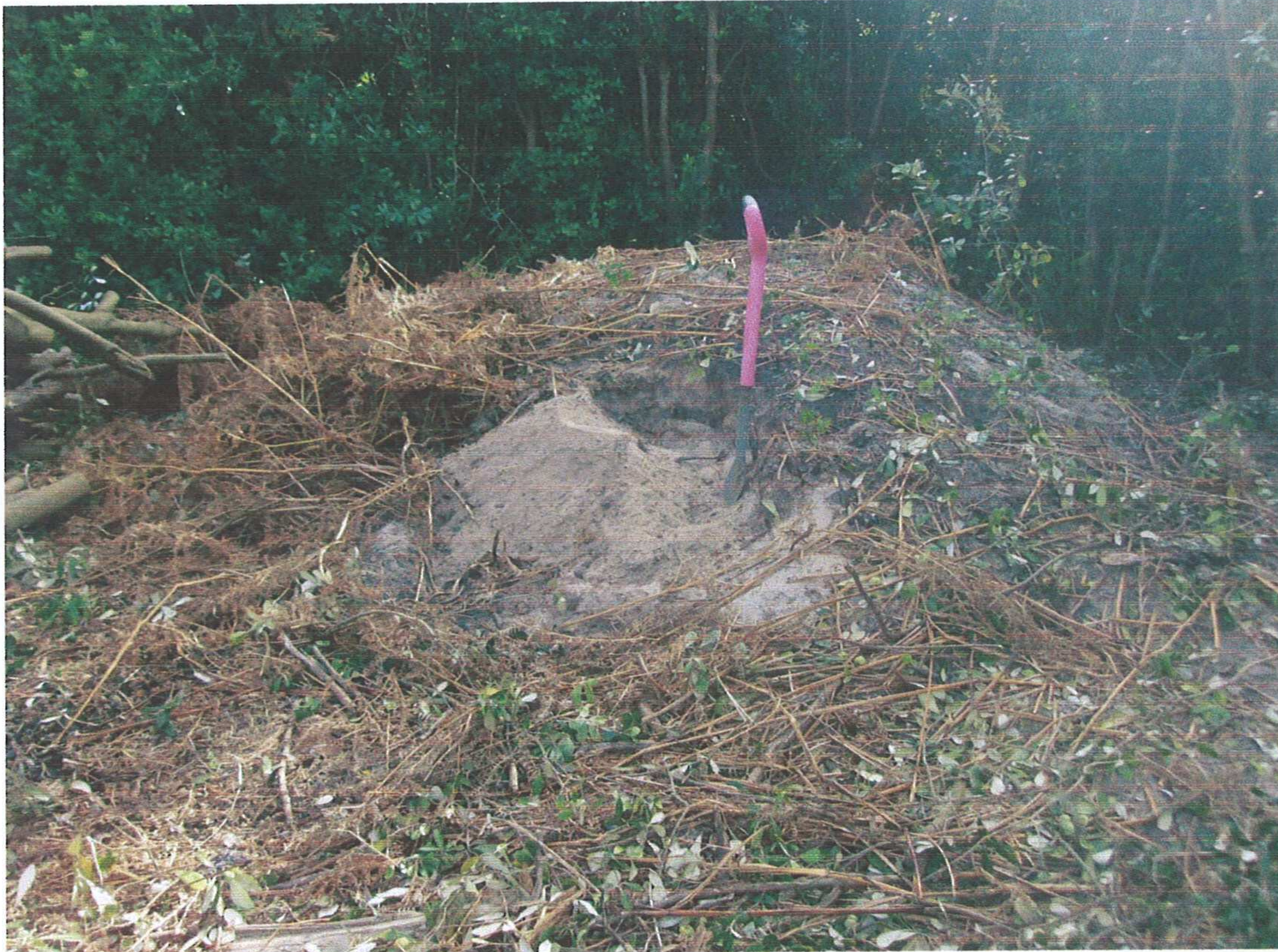
Soil excavated from the septic tank hole on proposed site 2009

RECEIVED BY THE PLANNING DEPARTMENT 11 OCT 2017