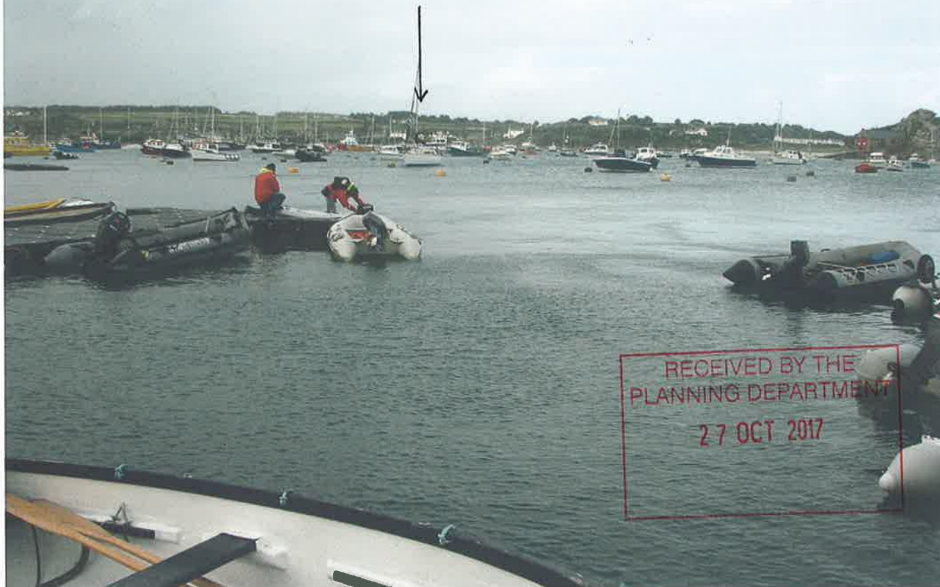
VIEW FROM QUAY

RECEIVED BY THE PLANNING DEPARTMENT 27 OCT 2017