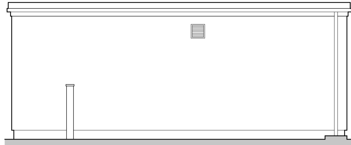
Existing Elevation A