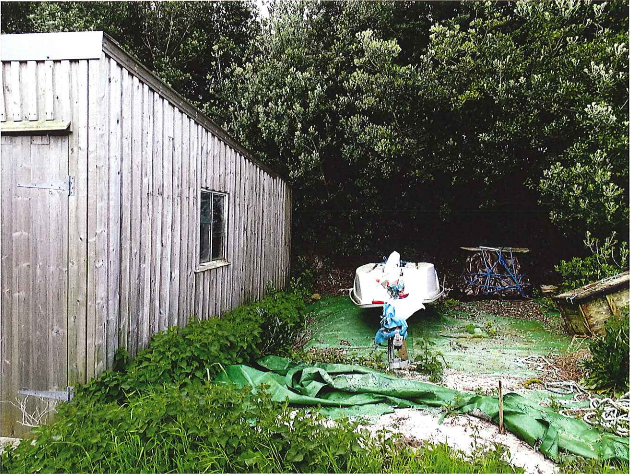
Area where extended store is planned.

RECEIVED BY THE PLANNING DEPARTMENT 02 MAY 2018