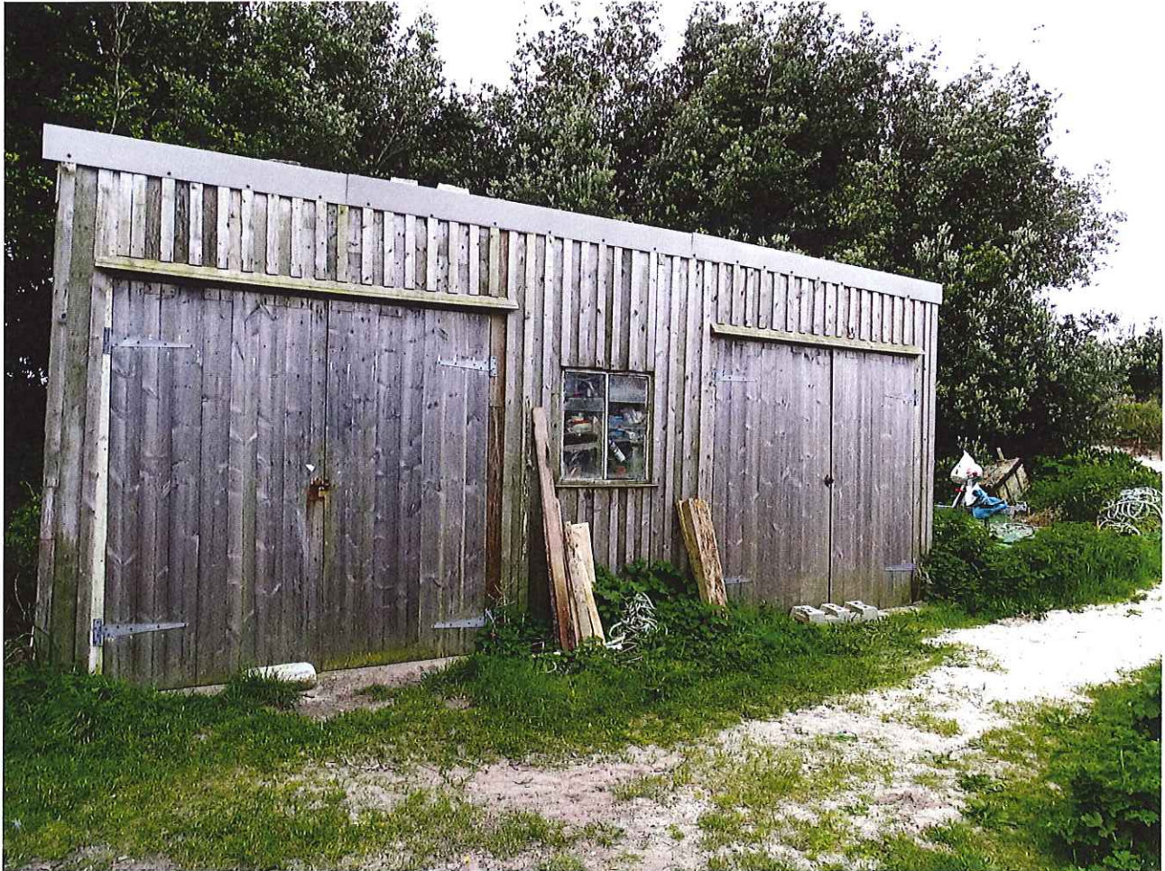
Existing building is timber framed and timber clad. Extension of store planned for right hand end.

RECEIVED BY THE PLANNING DEPARTMENT 02 MAY 2018