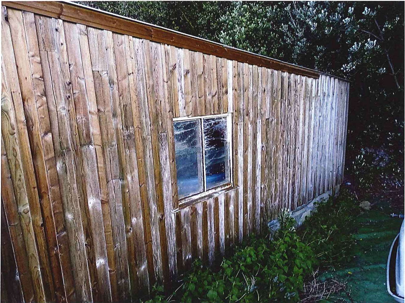
Green line indicates level of extension floor, stepped up 0.42m above floor of existing building. Cladding and window from this end will be re-applied to right hand end of extension.

RECEIVED BY THE PLANNING DEPARTMENT 02 MAY 2013