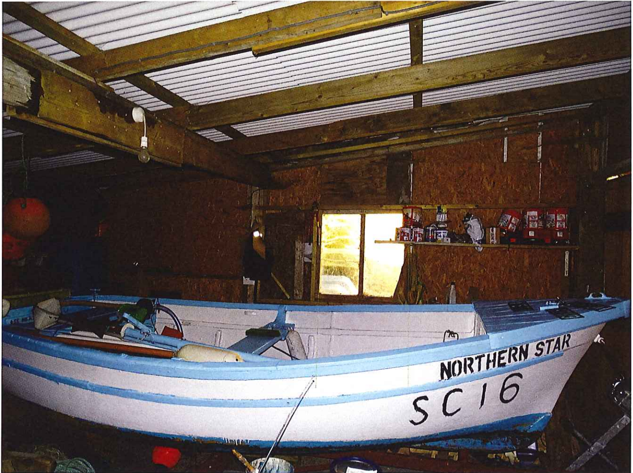
View from inside existing store showing window that will become door aperture to extended store, shown by green lines.

RECEIVED BY THE PLANNING DEPARTMENT 02 MAY 2018