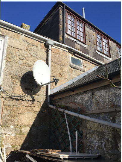
Neighbouring dormer and building height

GENERAL NOTES: This drawing must not be copied in whole or in part without prior written permission of MATT BALL ARCHITECTURE. This drawing must be read in conjunction with other architect's drawings & all schedules/Building Bye-Law check list and with all relevant structural engineering drawings, details and specifications. It is the contractor's responsibility to ensure that all work is carried out in accordance with all statutory requirements and to the approval of the building control officer (B.C.O.). The contractor is responsible for the setting out of the works. Any discrepancy found between this drawing and any other architect's detail drawing, schedule and/or specification must be reported to the architect before the work is carried out. Do not scale from this drawing. Refer only to written dimensions. All dimensions must be checked on site. The relevant British Standards for materials and their uses are to be adhered to. Manufacturers installation & fitting instructions must be obtained and adhered to at all times.