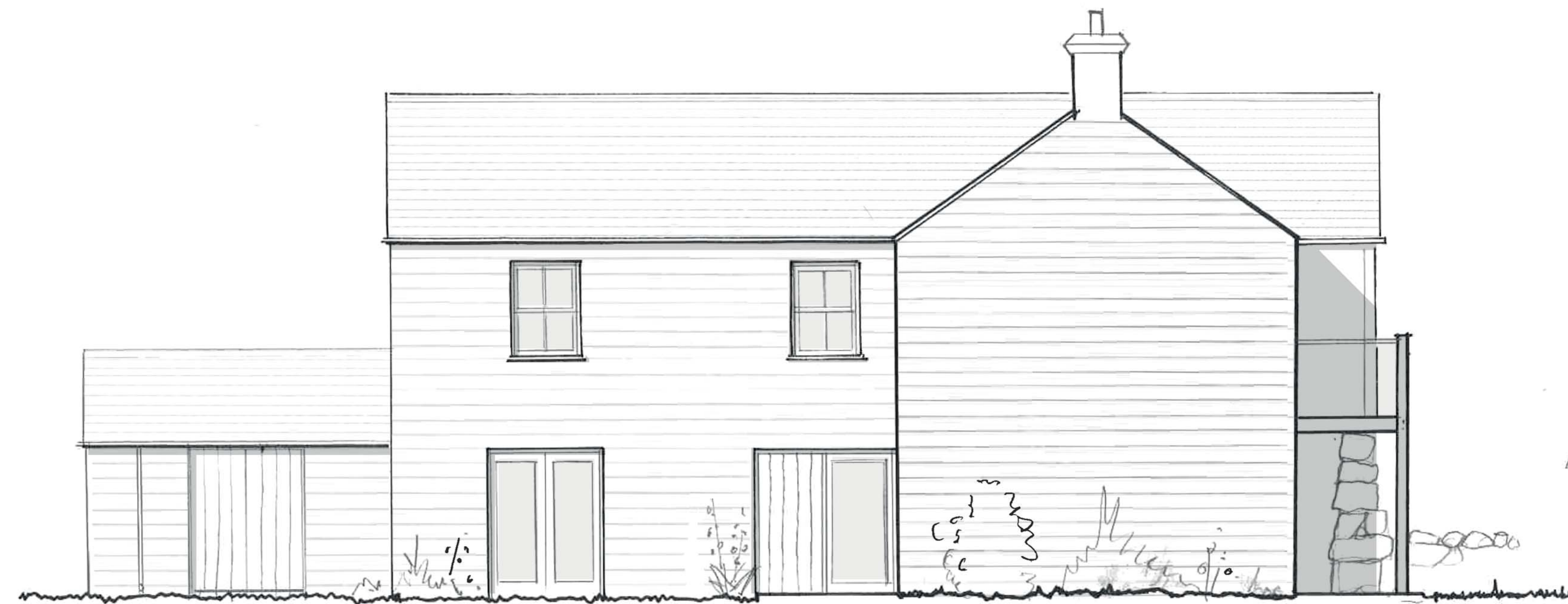
SOUTH ELEVATION PROPOSED