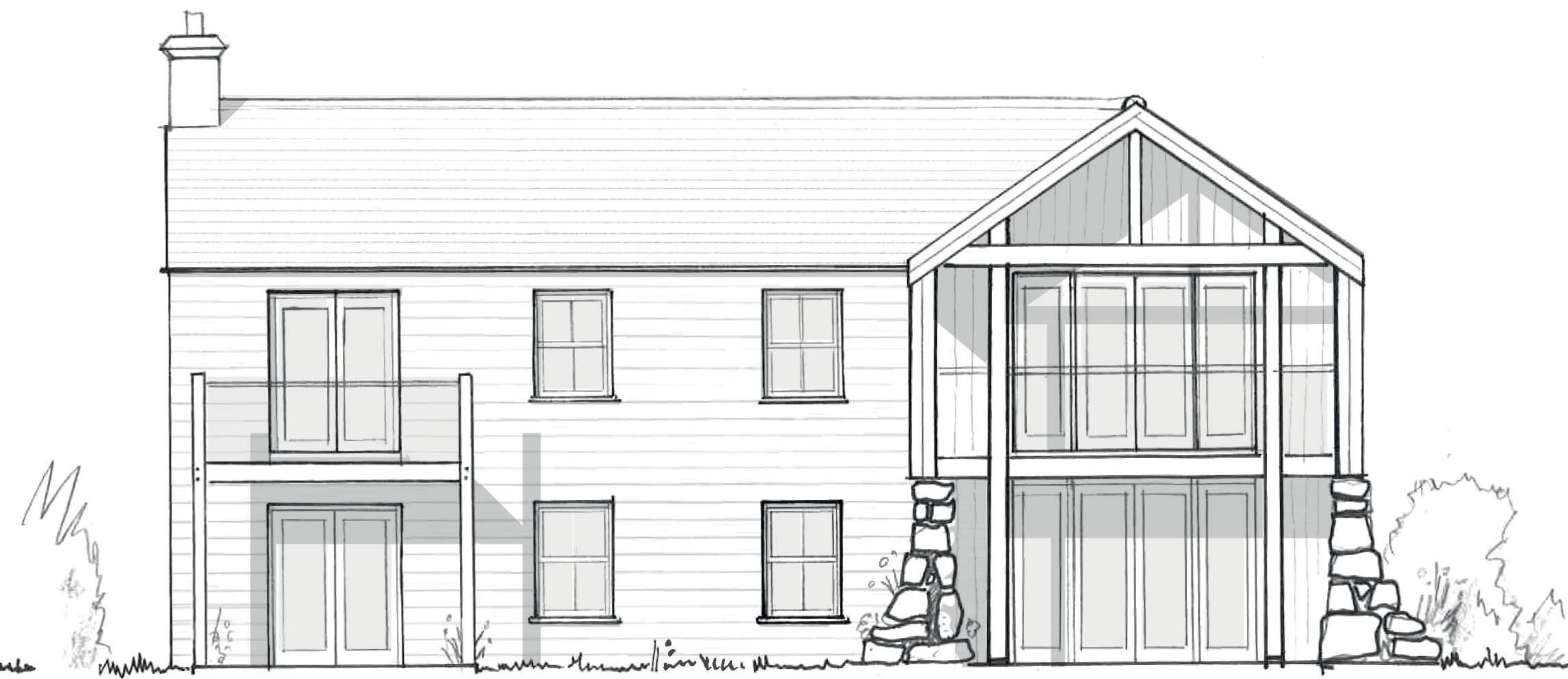
EAST ELEVATION PROPOSED