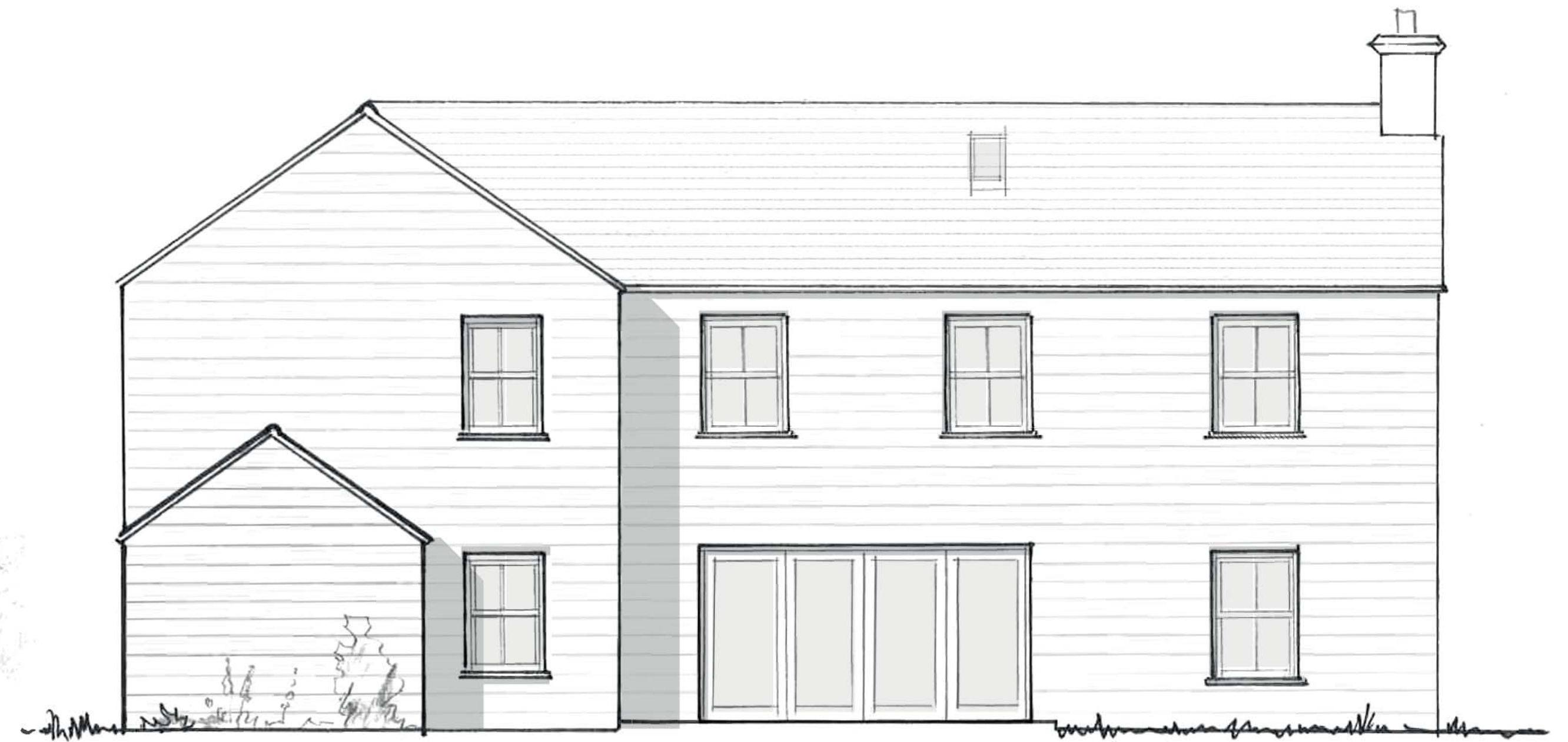
WEST ELEVATION PROPOSED