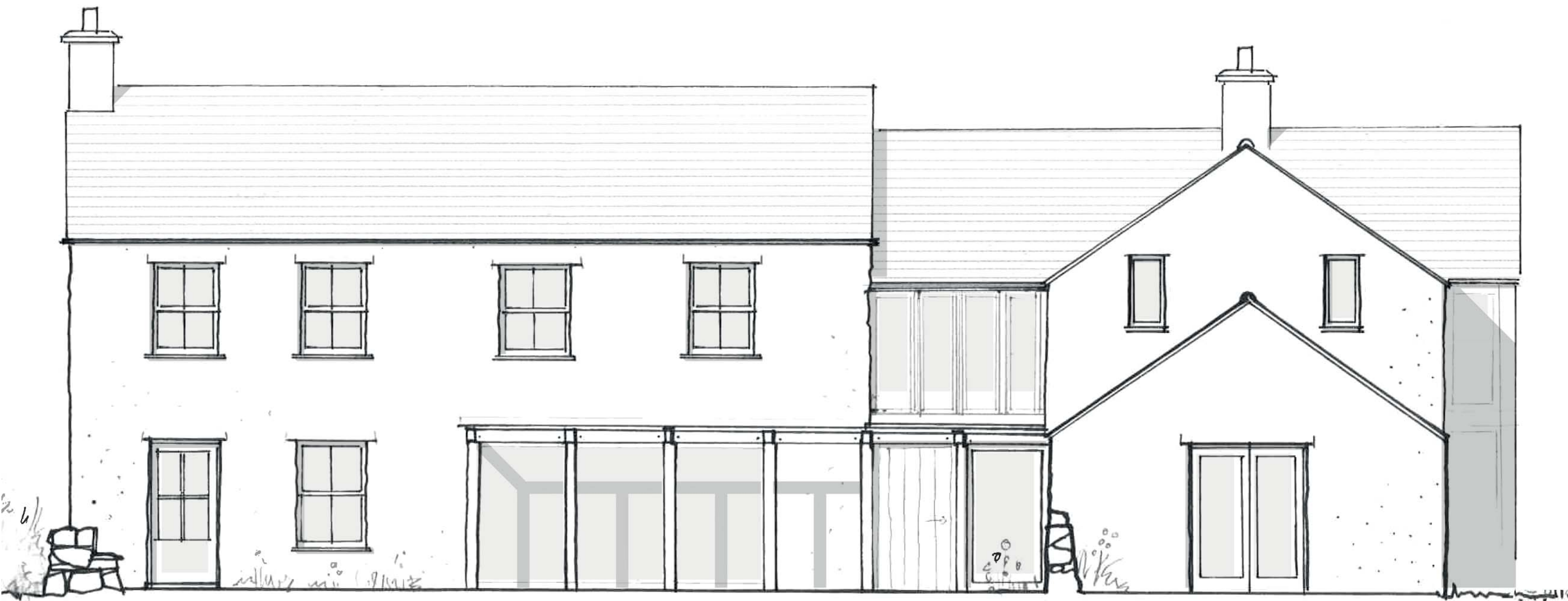
SOUTH WEST ELEVATION PROPOSED