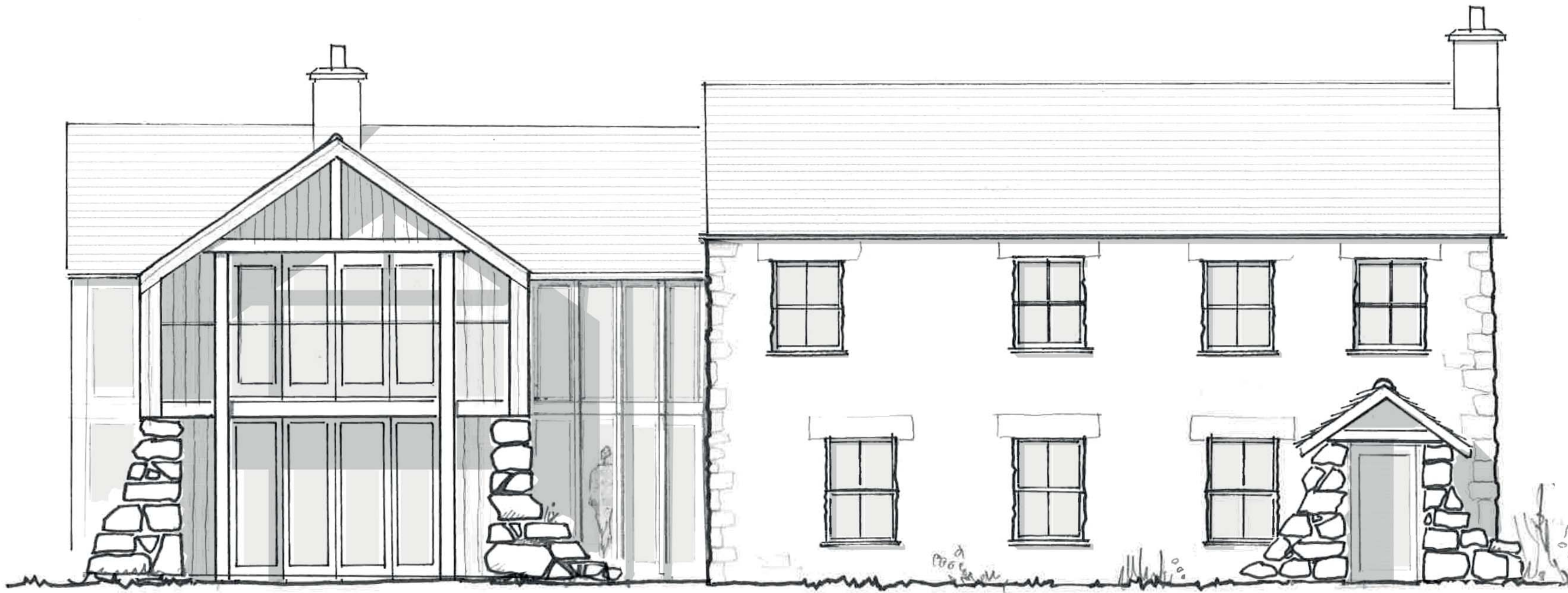
NORTH EAST ELEVATION PROPOSED