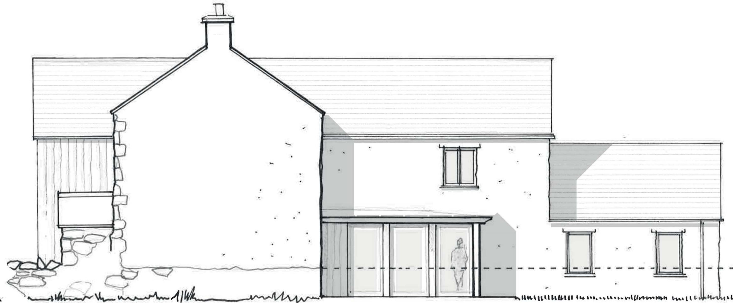
NORTH WEST ELEVATION PROPOSED