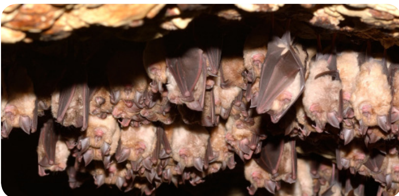
Greater Horseshoe bats