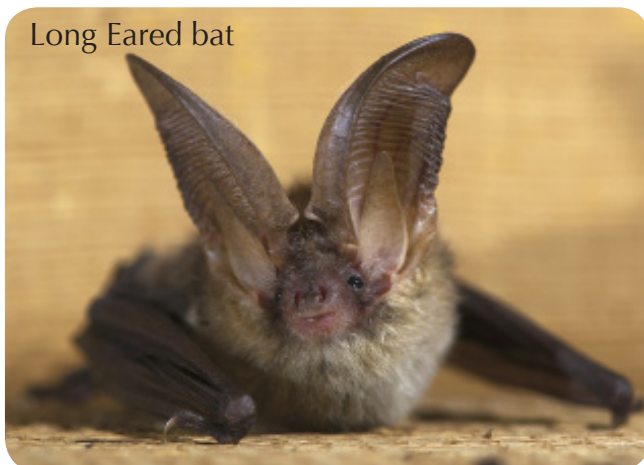
Long Eared bat

If the development cannot avoid disturbance or other impact to bats, even for a temporary period, a 'licence' to carry out the proposed works must be obtained from the appropriate licensing body* before development can take place. This will need to be done following the granting of planning permission. The licence application can be submitted by the ecologist on your behalf. Your ecologist will be able to advise you on the process further.