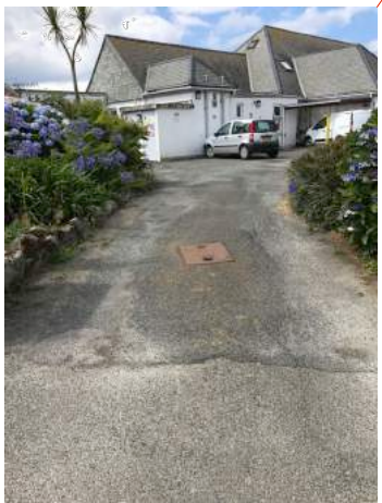
Photograph 1 Indicating entrance into hospital site