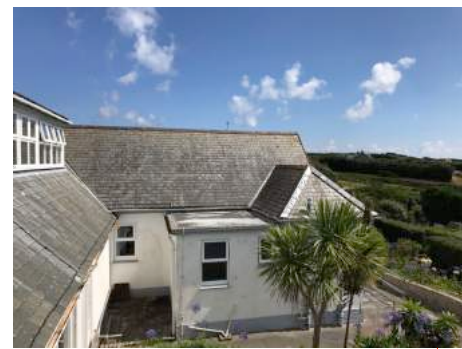
Photograph 9 Indicating flat roof requiring replacement