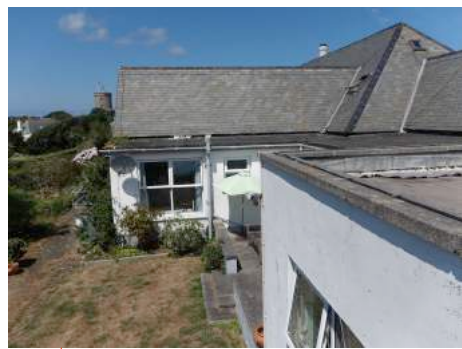
Photograph 10 Indicating flat roof requiring replacement