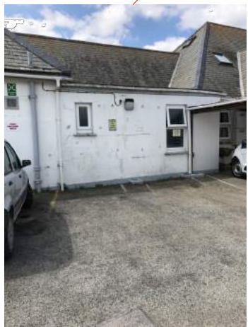
Photograph 2 Indicating flat roof to front elevation