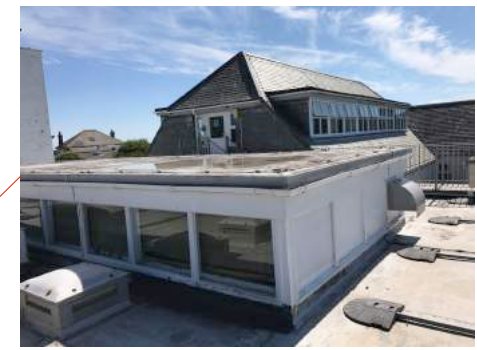
Photograph 7 Indicating raised north-light lantern detail