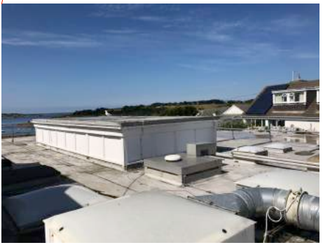
Photograph 4 Indicating raised north-light lantern detail