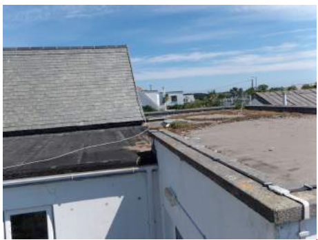
Photograph 11 Indicating flat roof requiring replacement