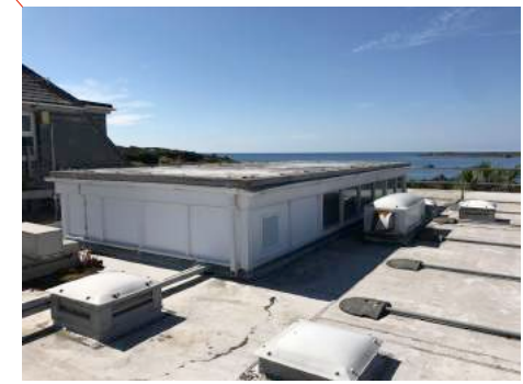
Photograph 5 Indicating raised north-light lantern detail