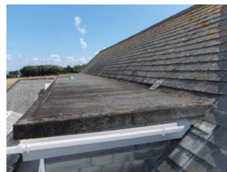
Photograph 3 Indicating flat roof to dormer window