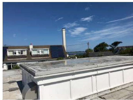
Photograph 8 Indicating raised north-light lantern detail