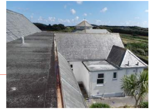
Photograph 6 Indicating flat roof to dormer window