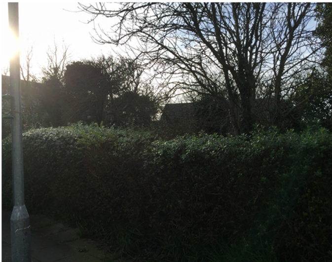
Fig 1. Existing hedge East side of site

The site is located to the south of Men a Vaur on Church Road and to the west of Branksea Close. The buildings to the east are predominantly established permanent residential houses however to the north many of the properties on Church Road including Men a Vaur and Rosvean House immediately adjacent the application site and several properties to the south and of the west on Rams Valley are residential holiday lets and guest house accommodation and it is considered therefore that the proposed use is not in conflict with the established settlement pattern. It is noted that the site is located within a conservation area, and an Area of Outstanding Natural Beauty.