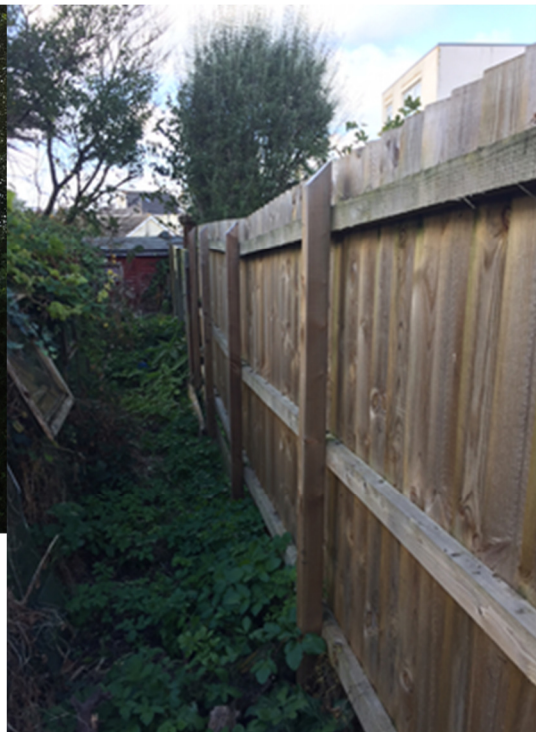
Fig 2. Existing fence North side of site