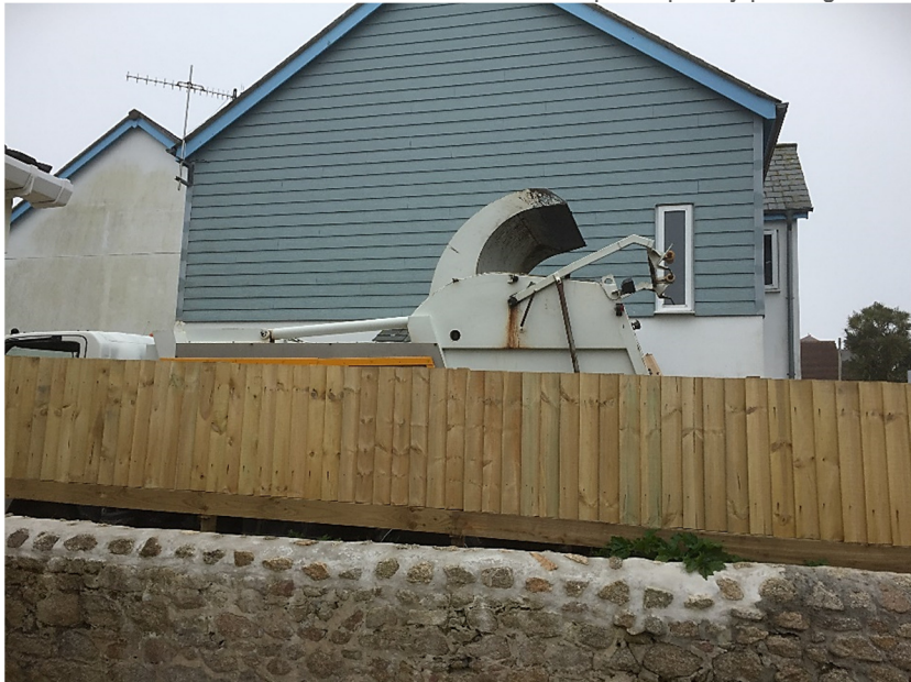
Fig 3. Dust cart accessing Branksea Close, to East side of Men-a-Vaur (July 2018)

The existing access off Church Road via Branksea Close is not proposed to be altered and has established street lighting. A new pedestrian point of access is proposed off Branksea Close in accordance with the plans attached. No vehicle parking spaces are proposed as parking provision is not envisaged as necessary for holiday let accommodation; however, service vehicles can adopt temporary parking on Church Road.