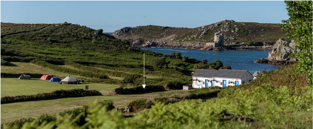
Proposed location near existing shower block, viewed from Watch Hill, south-west of campsite