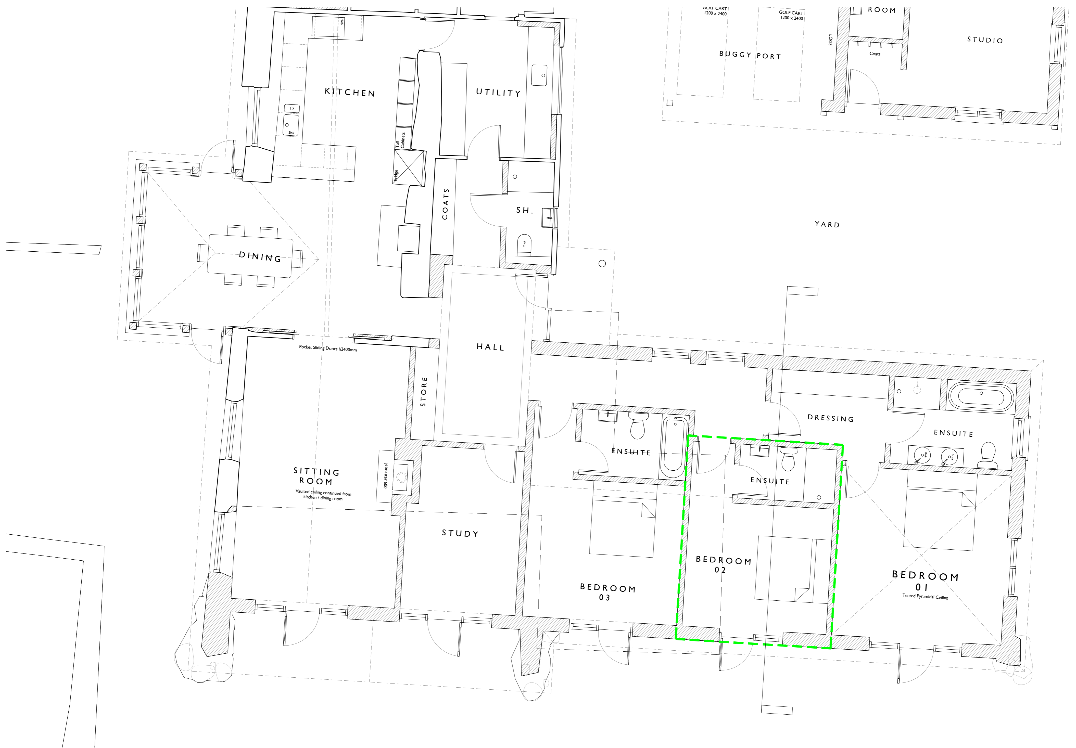
Proposed Bat Roost Location Plan