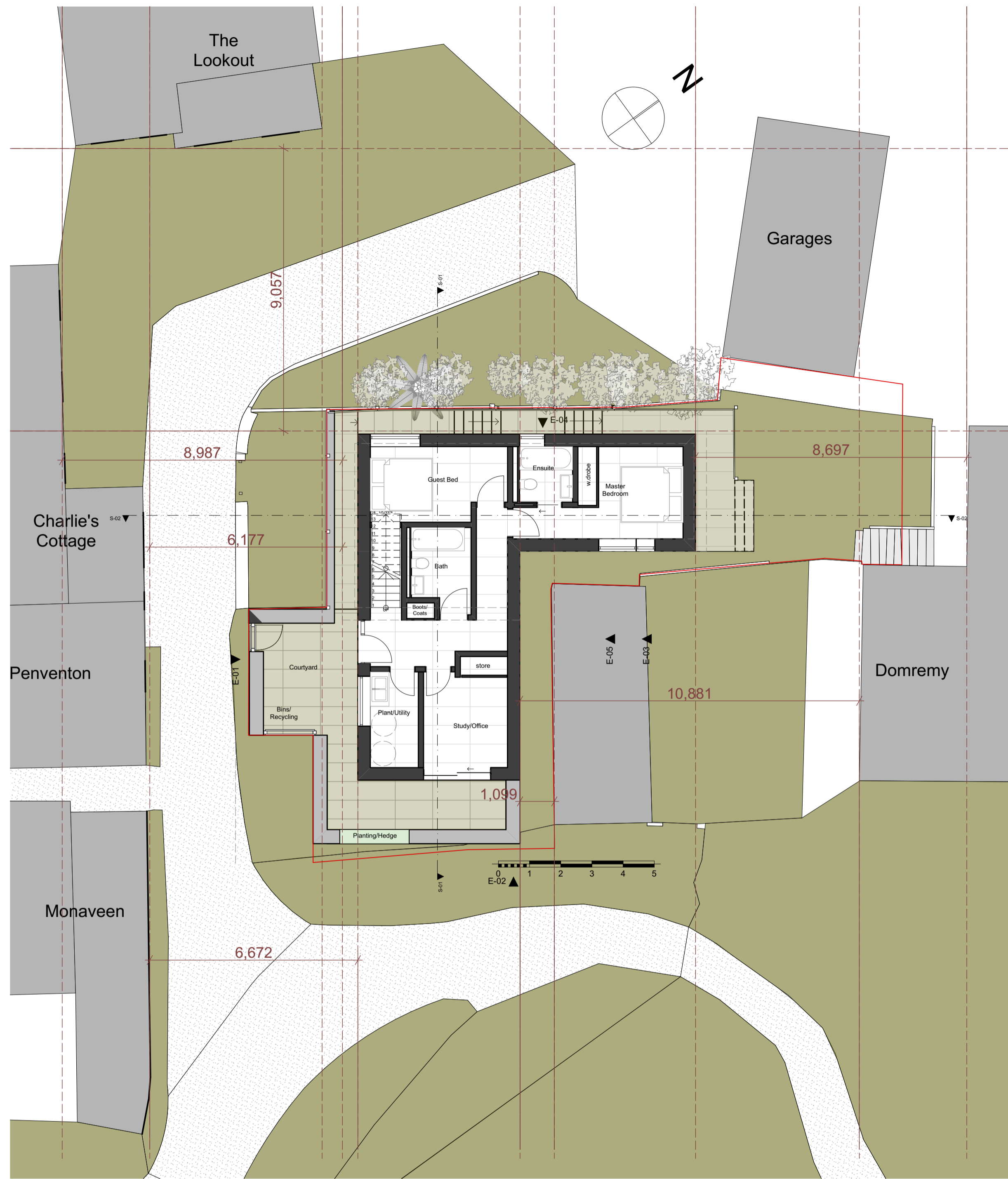
0. Proposed Ground/Site Plan 1:100