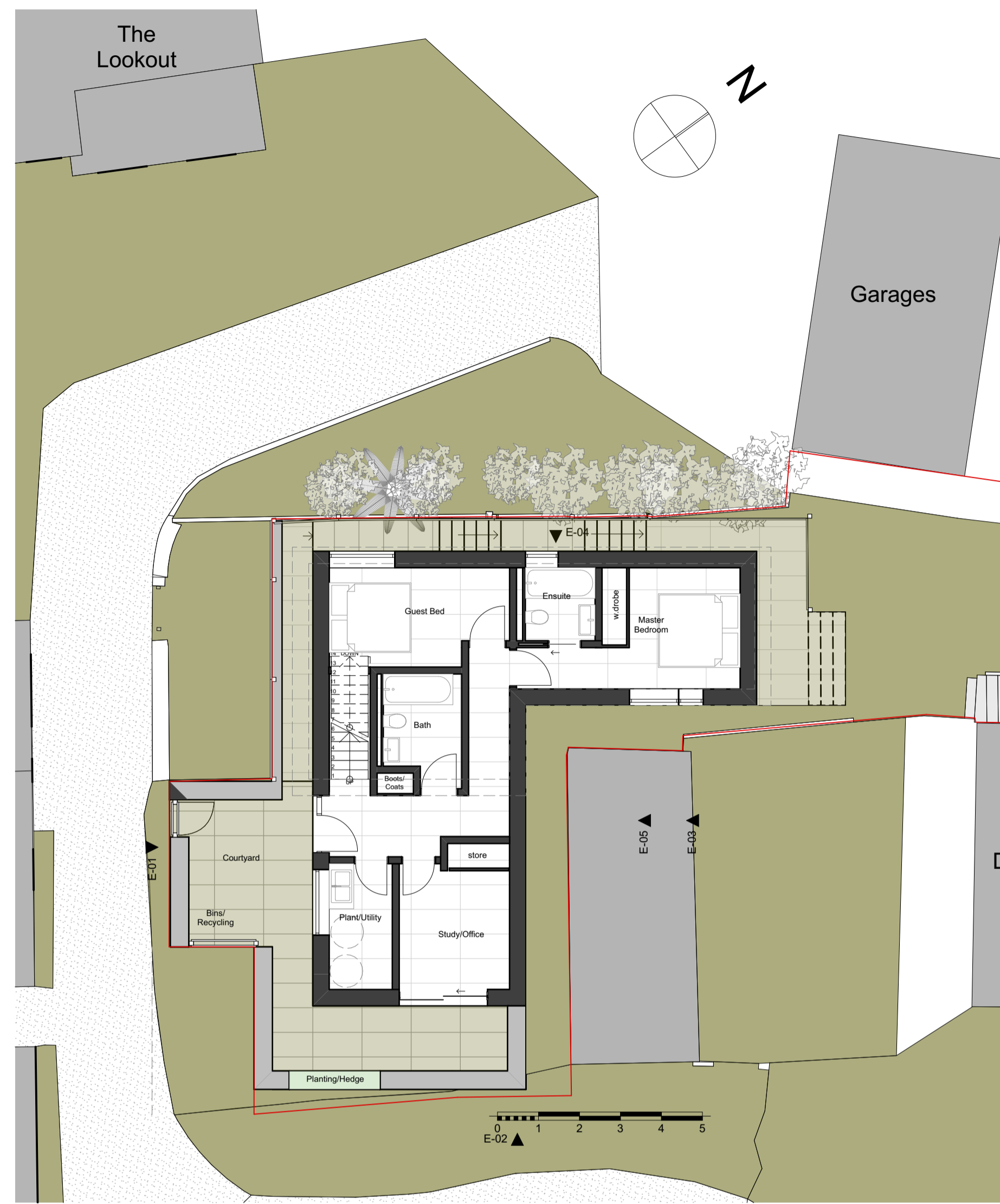
1. Proposed First Floor 1:100