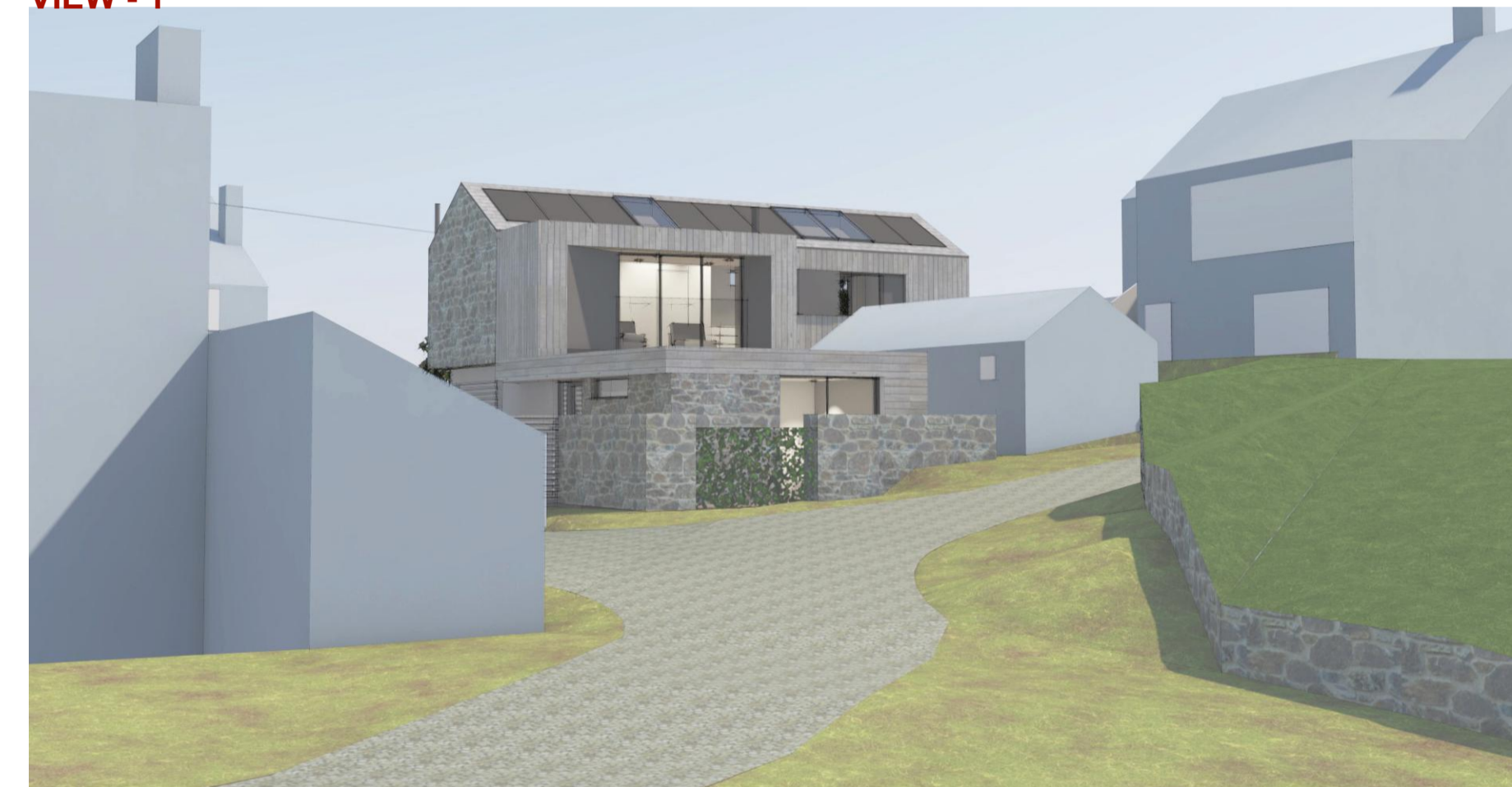
VIEW - 1 - EXTRACT