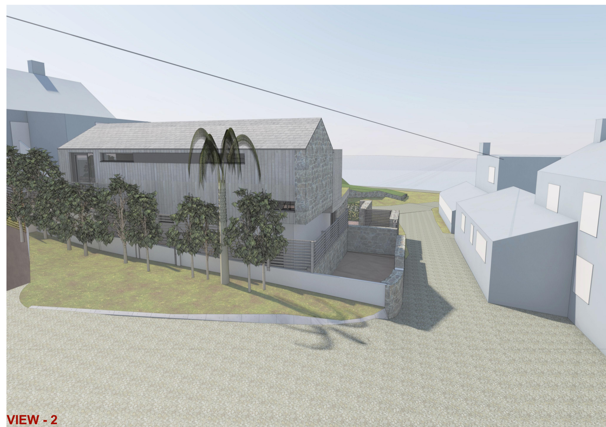
VIEW - 2