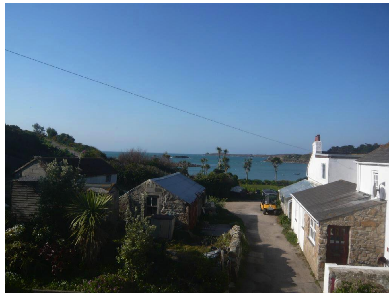
VIEW - 2 - Photo For Reference