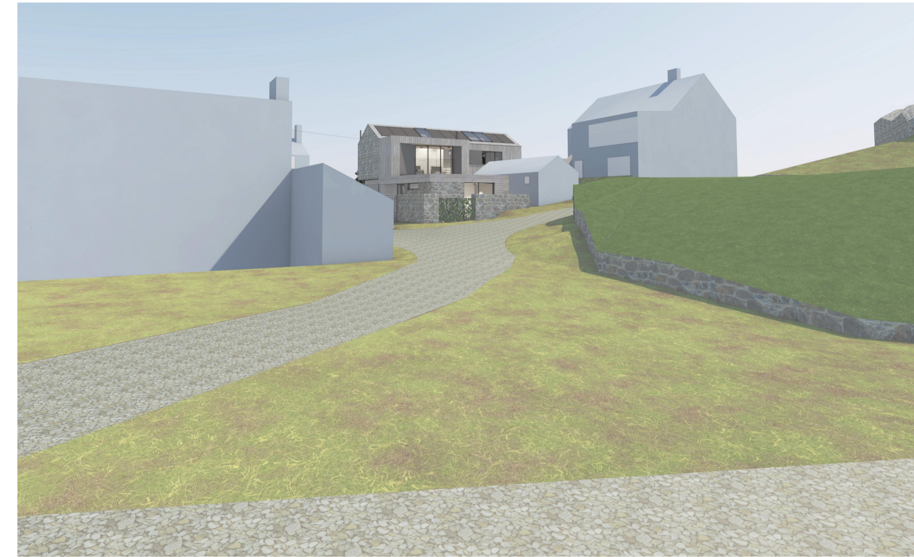
VIEW - 1