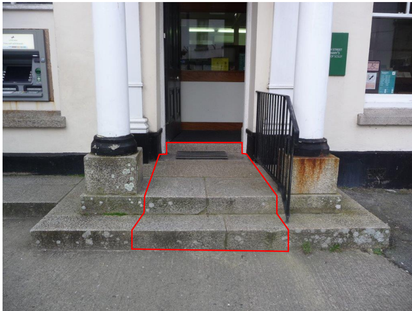
Extent of entrance steps to be removed

The interior of the branch has been subject to a modern fitout and generally consists of modern studwork partitions, componentry and furniture. It is proposed that the internal layout of the public area will be remodelled to provide better access and circulation areas.