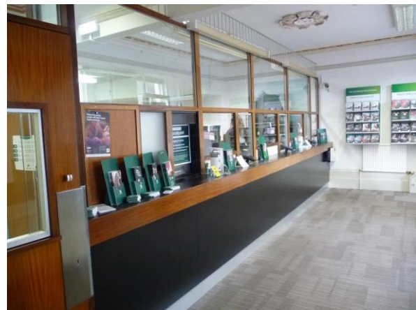
Existing Banking Hall