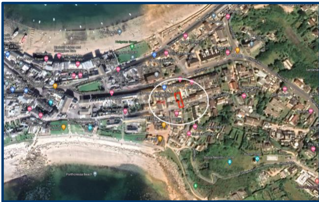
Figure 1 - Site Location (site outlined in red)