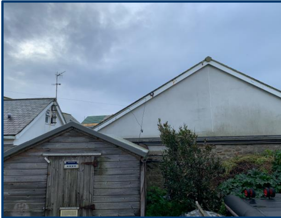
Figure 4 - Picture of Neighbouring Property