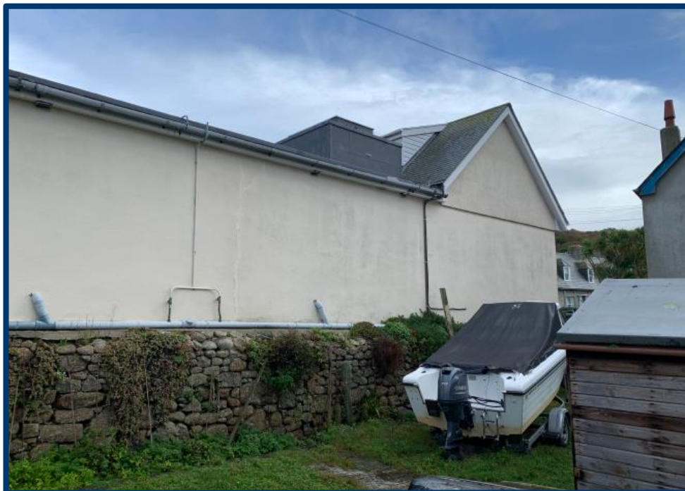
Figure 3 - Picture of Neighbouring Property