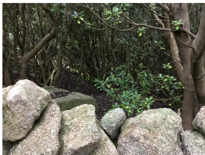
Looking over the pub boundary wall from Tinkler's Hill scheduled monument boundary through the dense pittosporum

The proposed development is nestled within the curtilage of the pub and as such will not be seen in the context of the Heritage Assets and will not have an impact. There are no Heritage Assets listed on the proposed site itself.