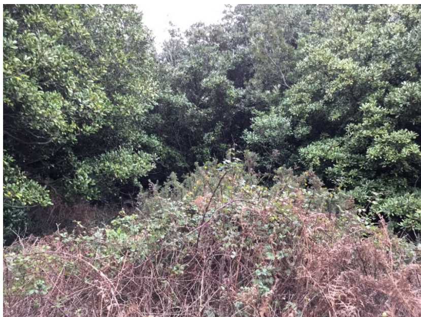
View from proposed site looking up the hill towards the scheduled monument

Image from historicengland.org.uk showing boundary of prehistoric cairn cemetery and field system on Tinkler's Hill