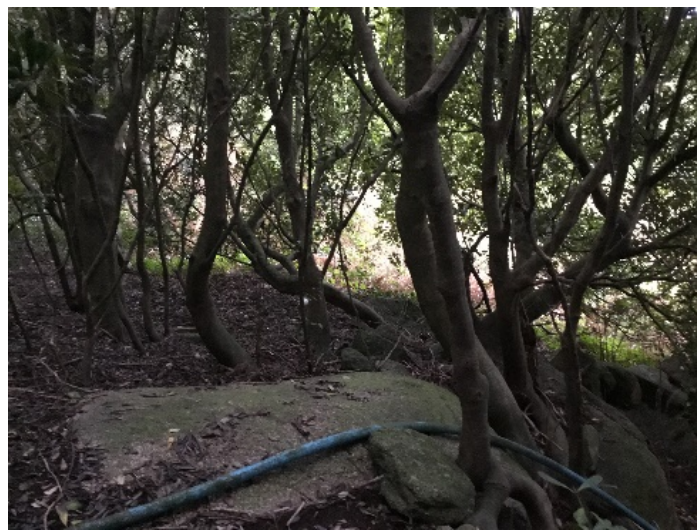
Looking down through the pittosporum to the solar panel array site and pub roof