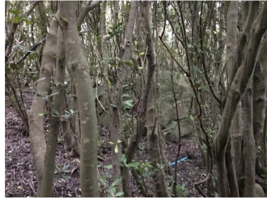
The dense band of pittosporum trees and large granite boulders above the site before the pub land ends and the boundary of the scheduled monument.