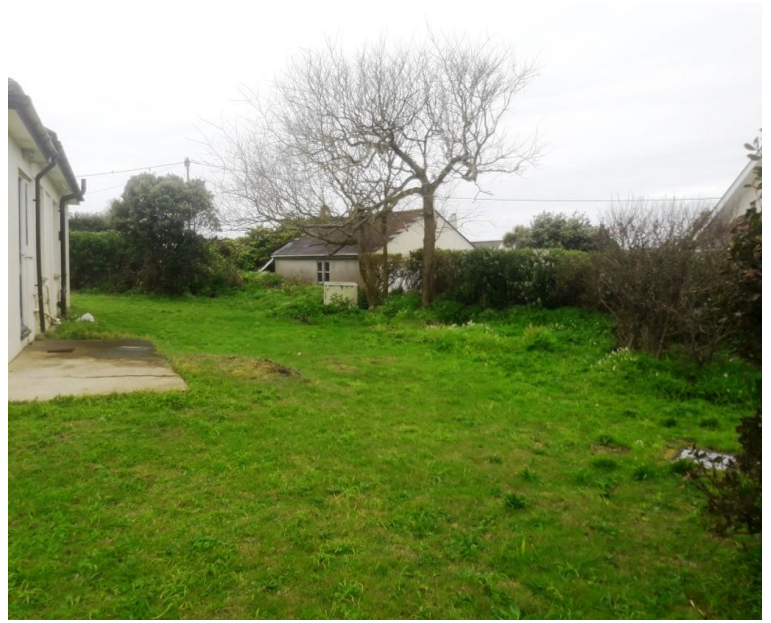
Photo 3. Expanse of improved grassland and Dutch Elm in background

half of the garden (see photos 2 and 4.). As a result the ground flora is dominated by Red Campion ( Silene dioica ), Hogweed ( Heracleum sphondylium ), Common Nettle ( Urtica dioica ) and Scarlet Pimpernel ( Anagallis arvensis ). Immediately to the south-west a small patch of Sheep's-sorrel ( Rumex acetosella ), Cleavers ( Galium aparine ), Common Cat's-ear ( Hypochaeris radicata ) and Procumbent Pearlwort ( Sagina procumbens ) suggest more acid conditions, likely due to a previous fire site. Under all the hedgerows the ground flora is dominated by the non-native invasive Three-cornered Leek ( Allium triquetum ) and Monbretia ( Crococsmia x corocosmiliflora ), which are also found scattered throughout the area of disturbed ground to the north and west of the site.