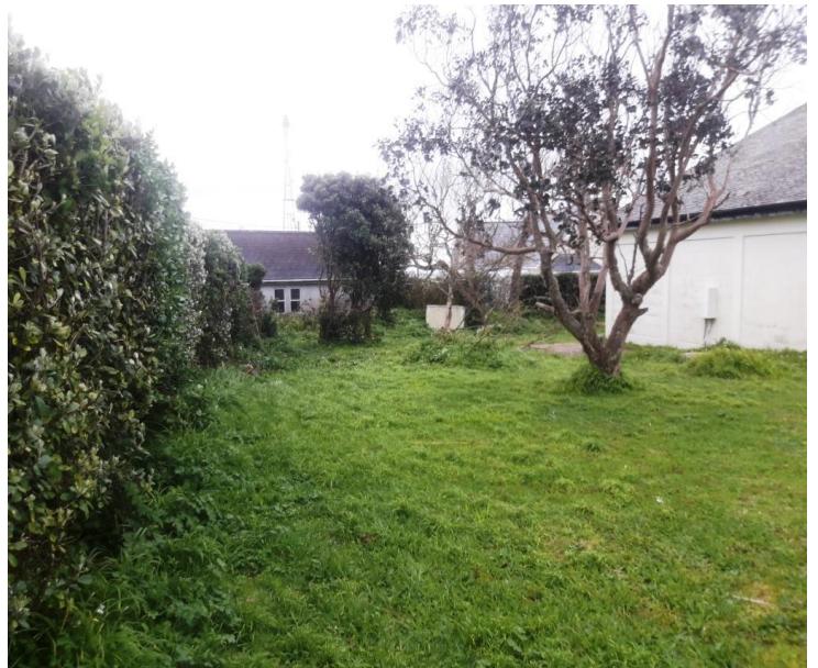
Photo 4 Disturbed grassland with Pittosporum hedge and Eucalyptus tree

half of the garden (see photos 2 and 4.). As a result the ground flora is dominated by Red Campion ( Silene dioica ), Hogweed ( Heracleum sphondylium ), Common Nettle ( Urtica dioica ) and Scarlet Pimpernel ( Anagallis arvensis ). Immediately to the south-west a small patch of Sheep's-sorrel ( Rumex acetosella ), Cleavers ( Galium aparine ), Common Cat's-ear ( Hypochaeris radicata ) and Procumbent Pearlwort ( Sagina procumbens ) suggest more acid conditions, likely due to a previous fire site. Under all the hedgerows the ground flora is dominated by the non-native invasive Three-cornered Leek ( Allium triquetum ) and Monbretia ( Crococsmia x corocosmiliflora ), which are also found scattered throughout the area of disturbed ground to the north and west of the site.