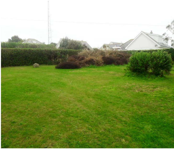
Photo 2. Expanse of improved grassland and brash pile in background