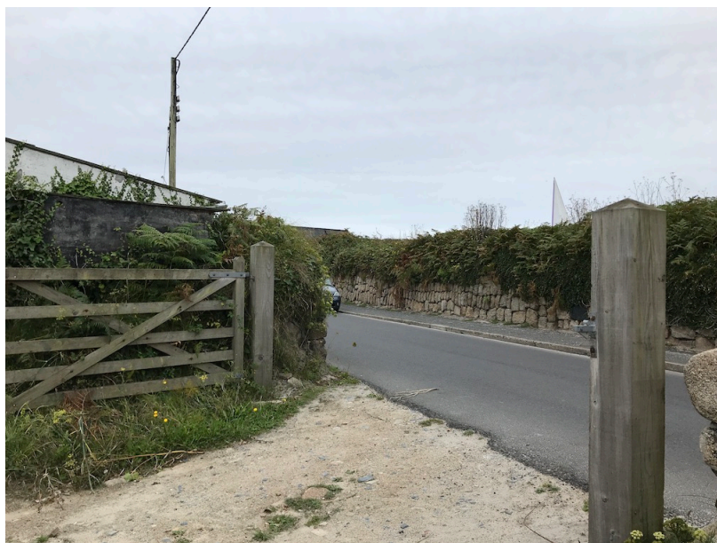
Existing timber gate and support posts from application site facing main road. Note poor visibility on LHS