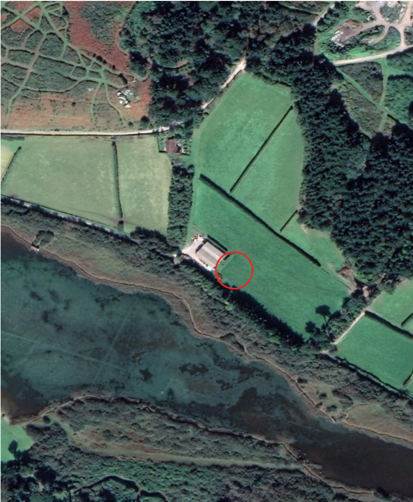
Proposed Site (Google Maps 2021)

This document has been prepared in support of an application for the temporary change of use of an existing agricultural plot to Class C3, in order to provide 5 units of temporary workers accommodation for a period of no more than 3 years. The proposed works would help to facilitate Tresco Estate Partnership’s policy for ongoing investment in improved accommodation for visitors to the island, by providing temporary accommodation for builders working on a number of proposed developments on Tresco. Invariably investment on Tresco has an indirect economic benefit to other islands, with transport services, employment, restaurant and retail services benefiting across the archipelago.