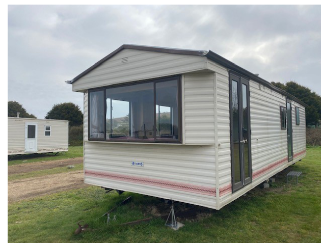
28ft x 10ft Static Caravan