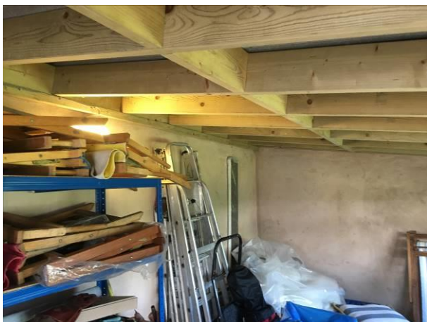
Photograph 5: Showing the interior of the building with the timber roof structure visible.