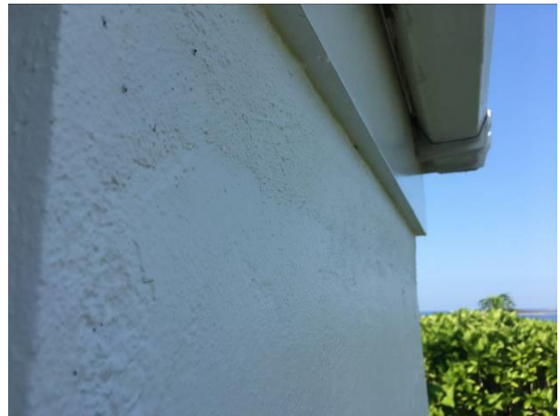
Photograph 4: Showing the tight fit between the fascia and the wall at all locations except above the windows.