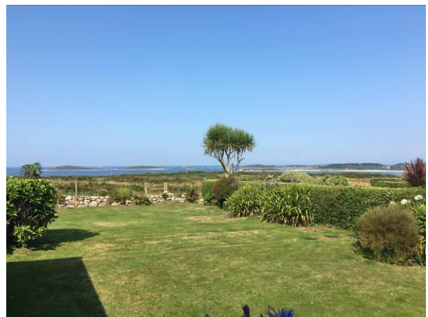
Photograph 6: Showing the landscape setting of the outbuilding (photograph taken from beside the building facing north-west across the residential garden).