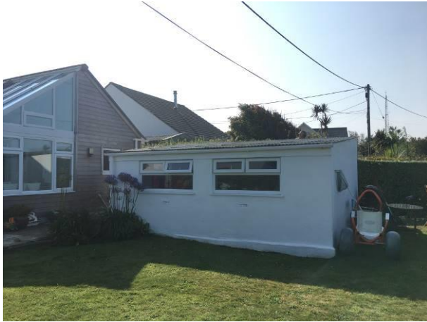
Photograph 1: Showing the outbuilding in context with the gable-end of the main residential property (Green Pastures) to the left.