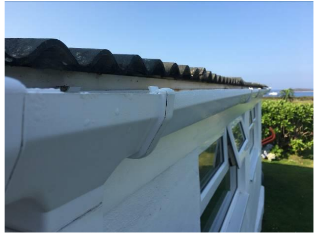
Photograph 2: Showing the guttering attached to the fascia board on the northern aspect – this fitting effectively blocks direct fly-in access to the gaps in the corrugated roof sheets.