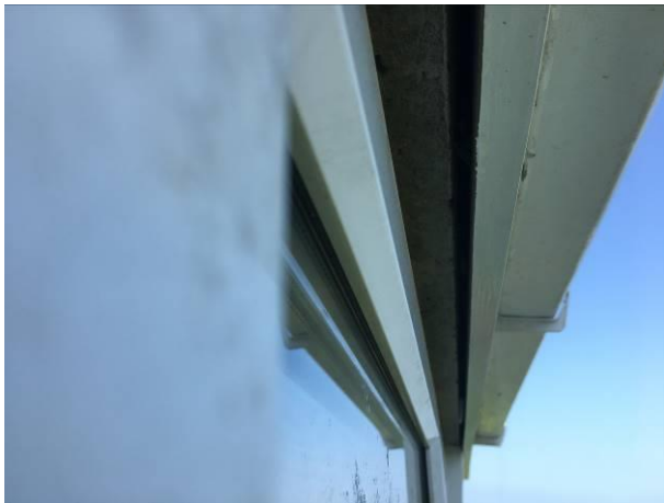
Photograph 3: Showing the gap beneath the fascia board on the northern aspect where it passes above the window, potentially allowing internal access to the outbuilding.