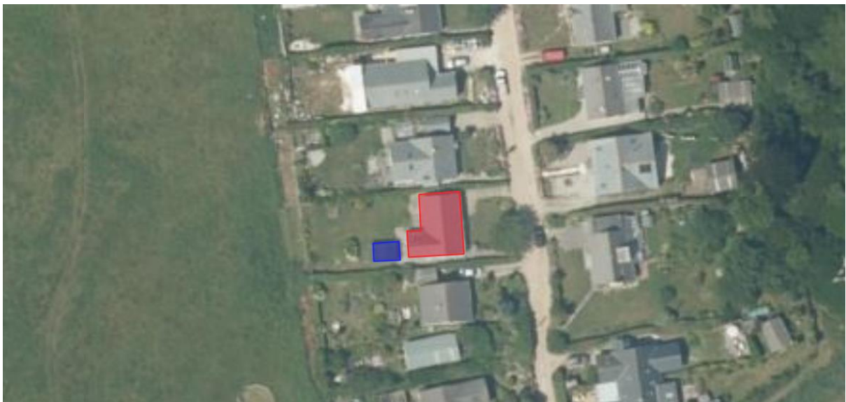
Map 02 – Showing the Outbuilding (blue) which was subject to the survey. The residential property of Green Pastures is shown in red – this was not subject to survey as part of this assessment.