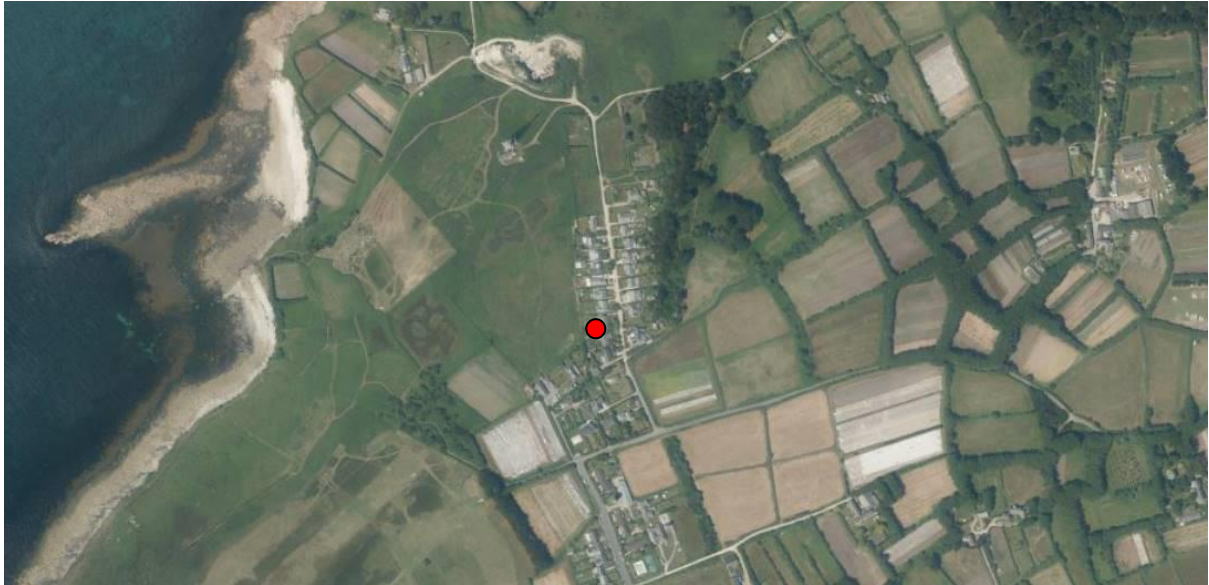
Map 01 – Illustrating location of property within the local environs (red circle). Reproduced in accordance with Google’s Fair Use Policy.