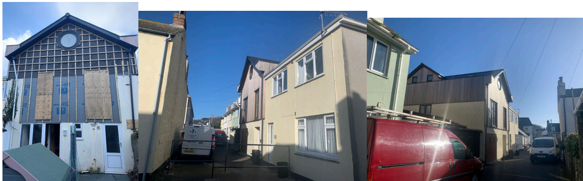
Rear elevation with modifications underway to clad and re-sized first floor windows.