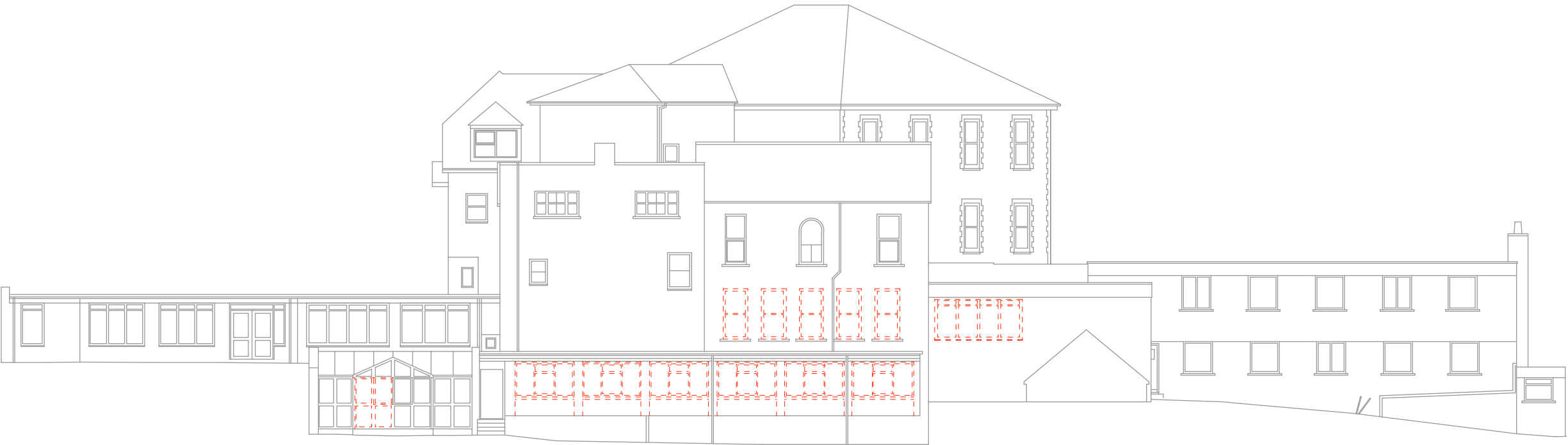
Existing Front Elevation showing demolition