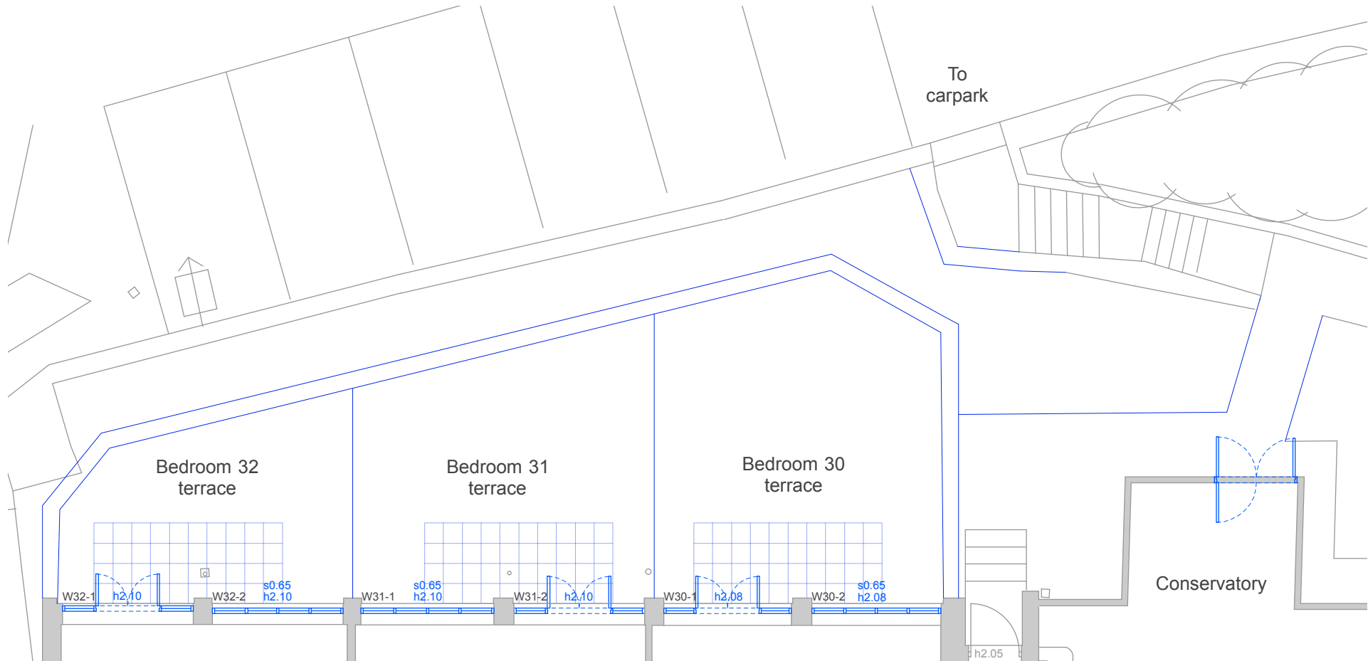
Proposed External Works