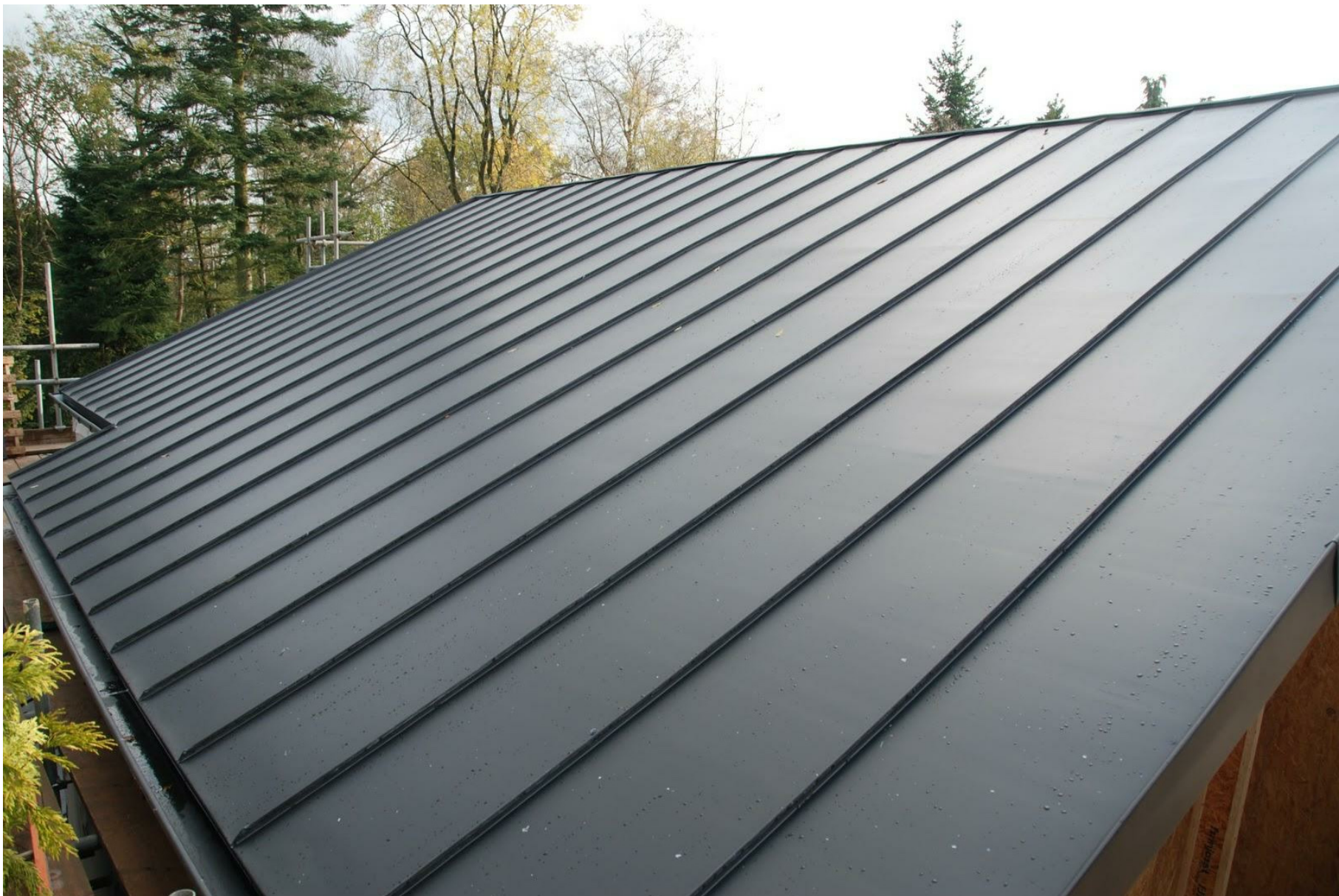
Sarnafil Roof with Seams