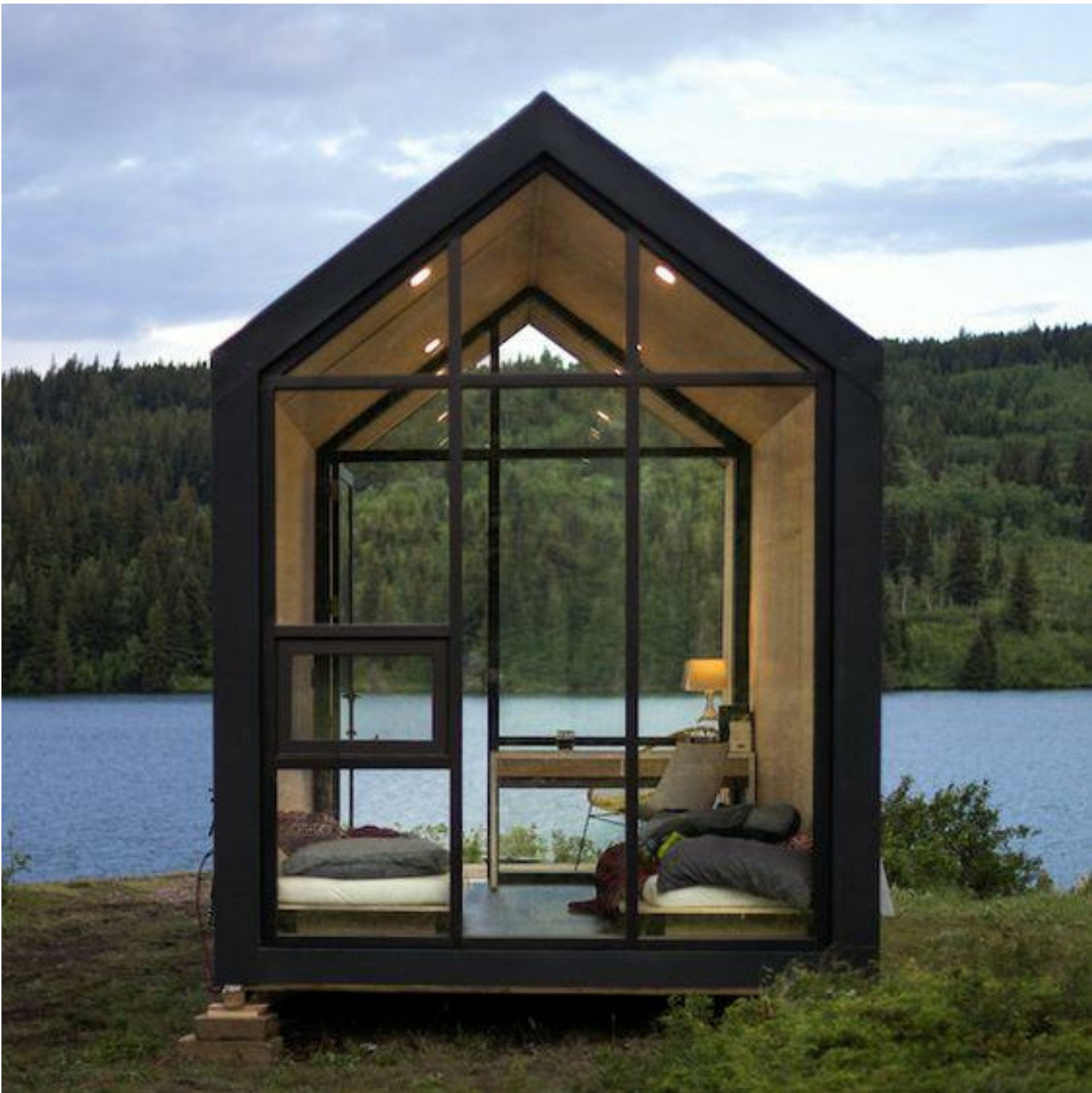
Precedent - Facing Aluminium gable material