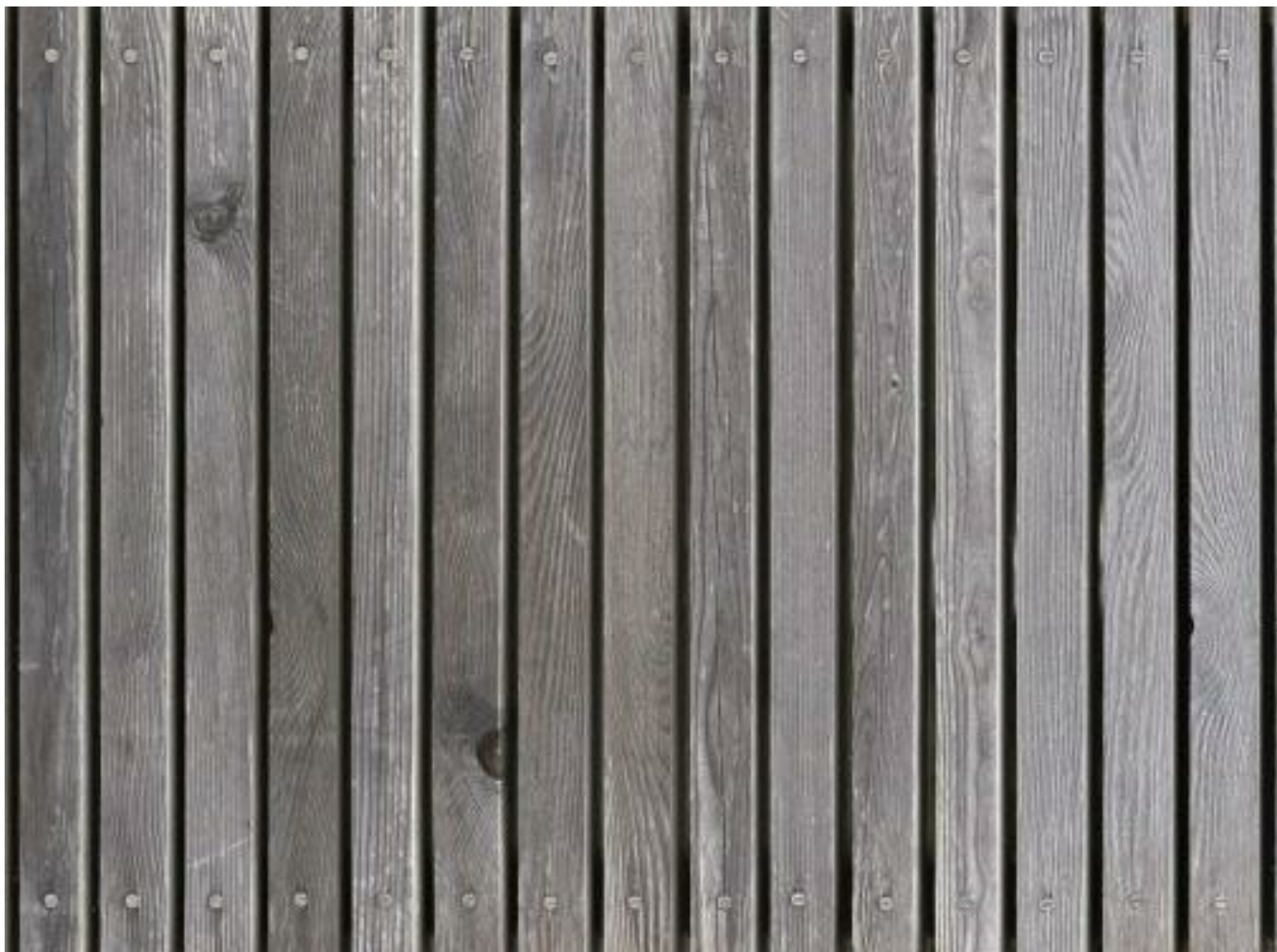
Vertical Timber Cladding