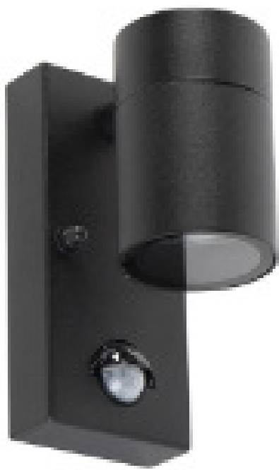
Example Security light