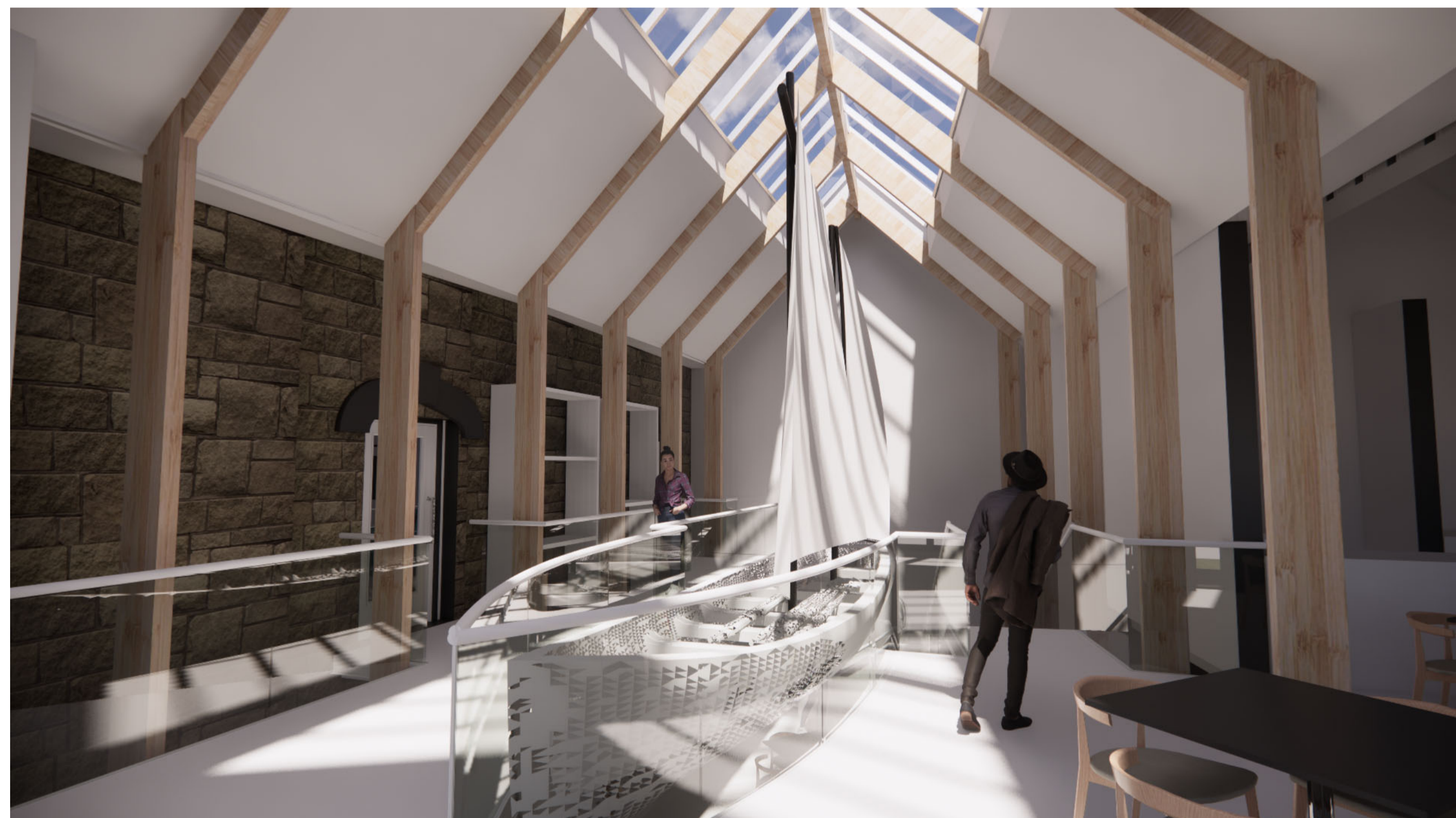
4 Boat Hall Gig Display 1:1