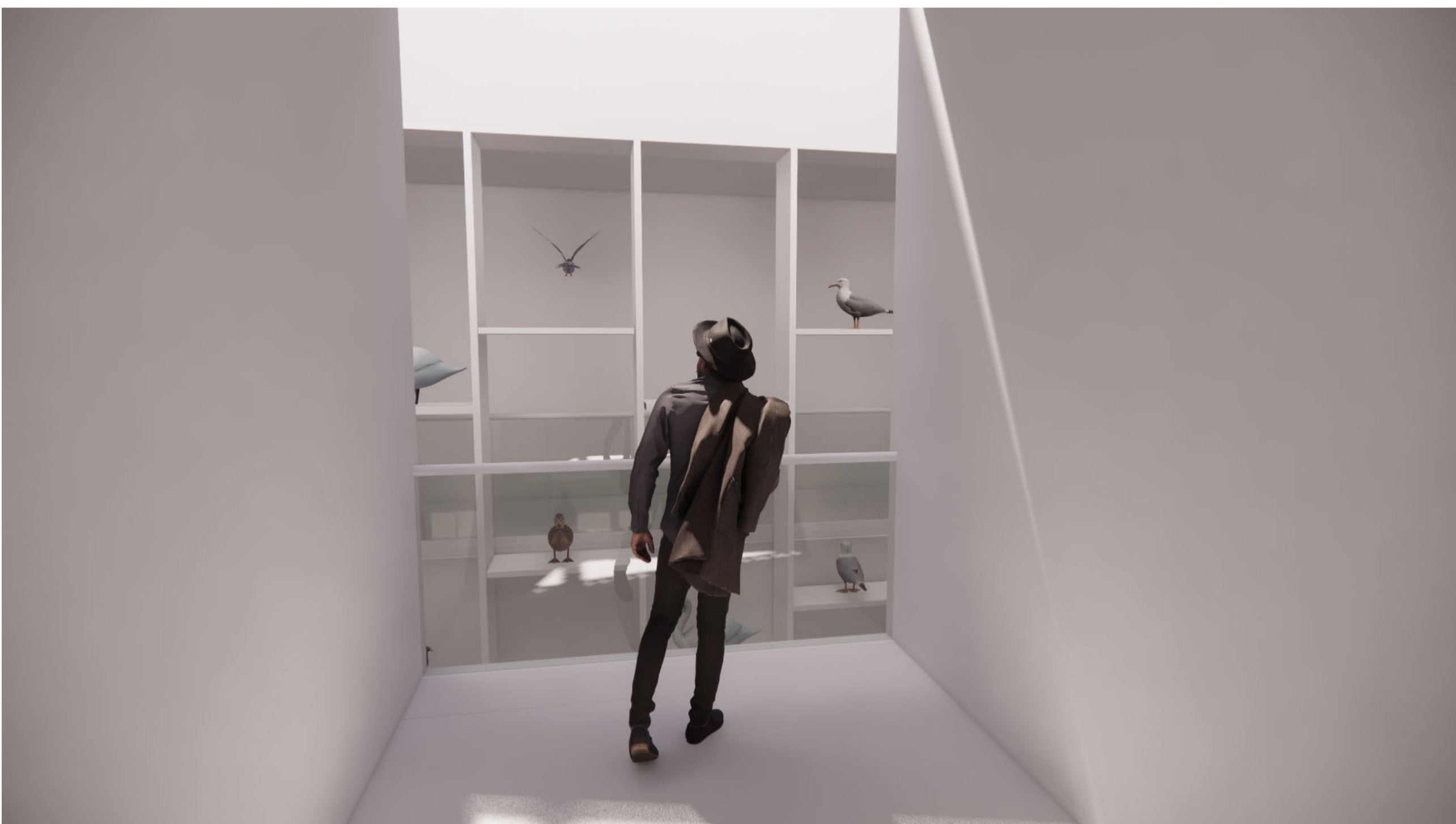
3 Bird Display Wall 1:1