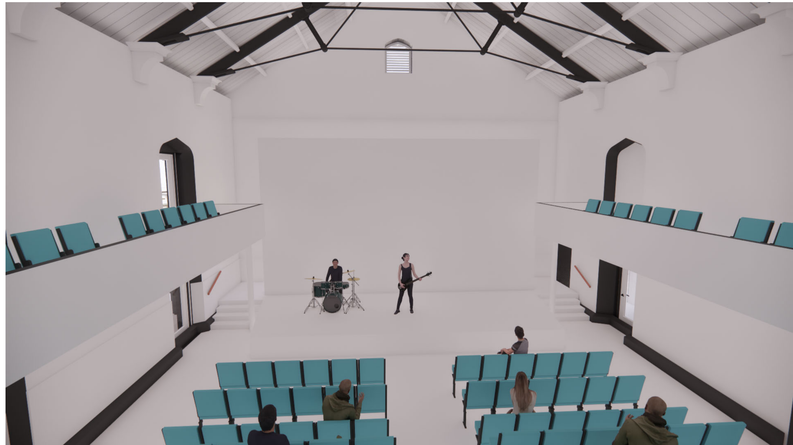
2 Town Hall 1:1