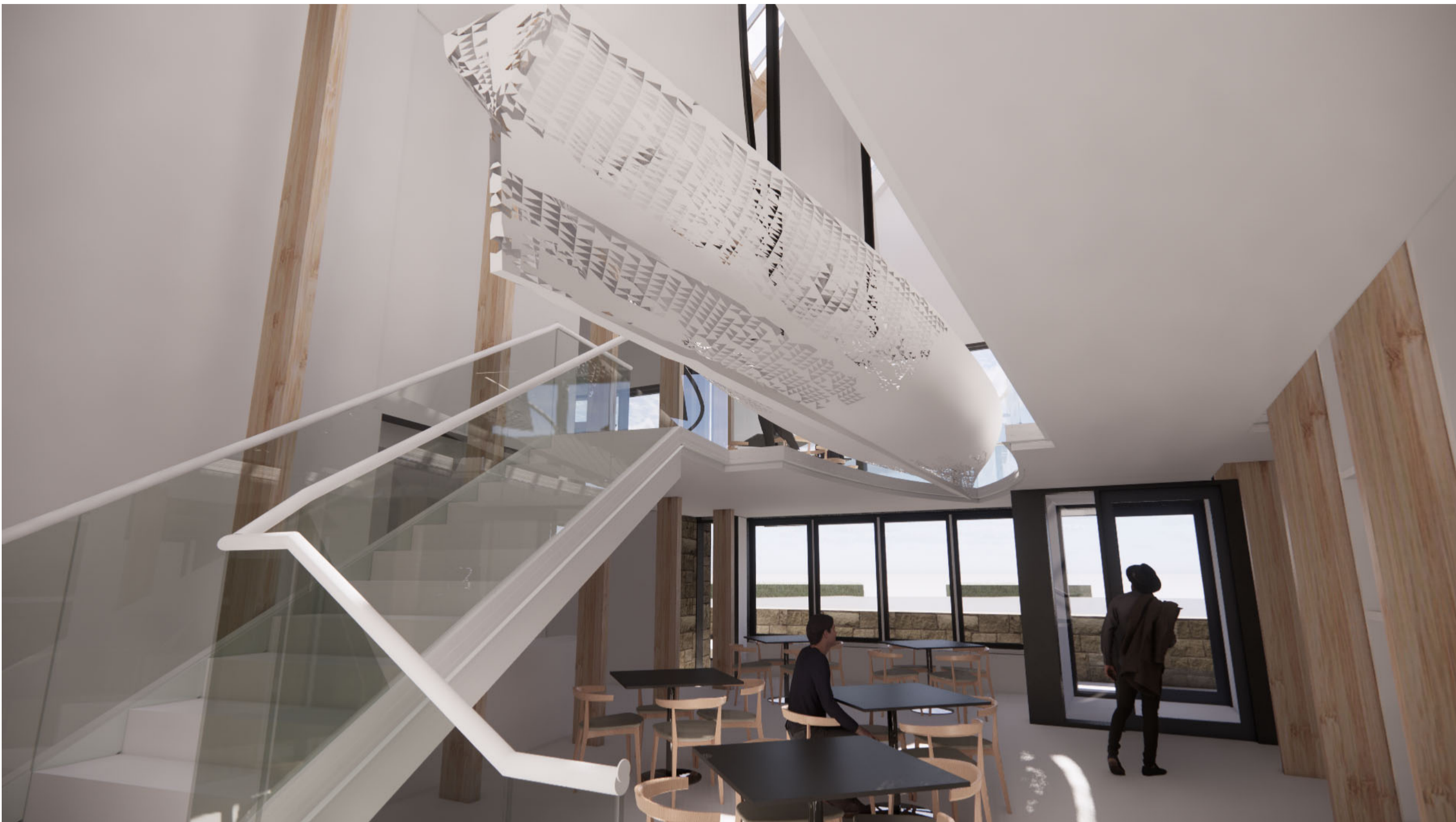
1 Boat Hall Cafe 1:1

DRAWING NUMBER 241601-PUR-01-ZZ-DR-A-2500