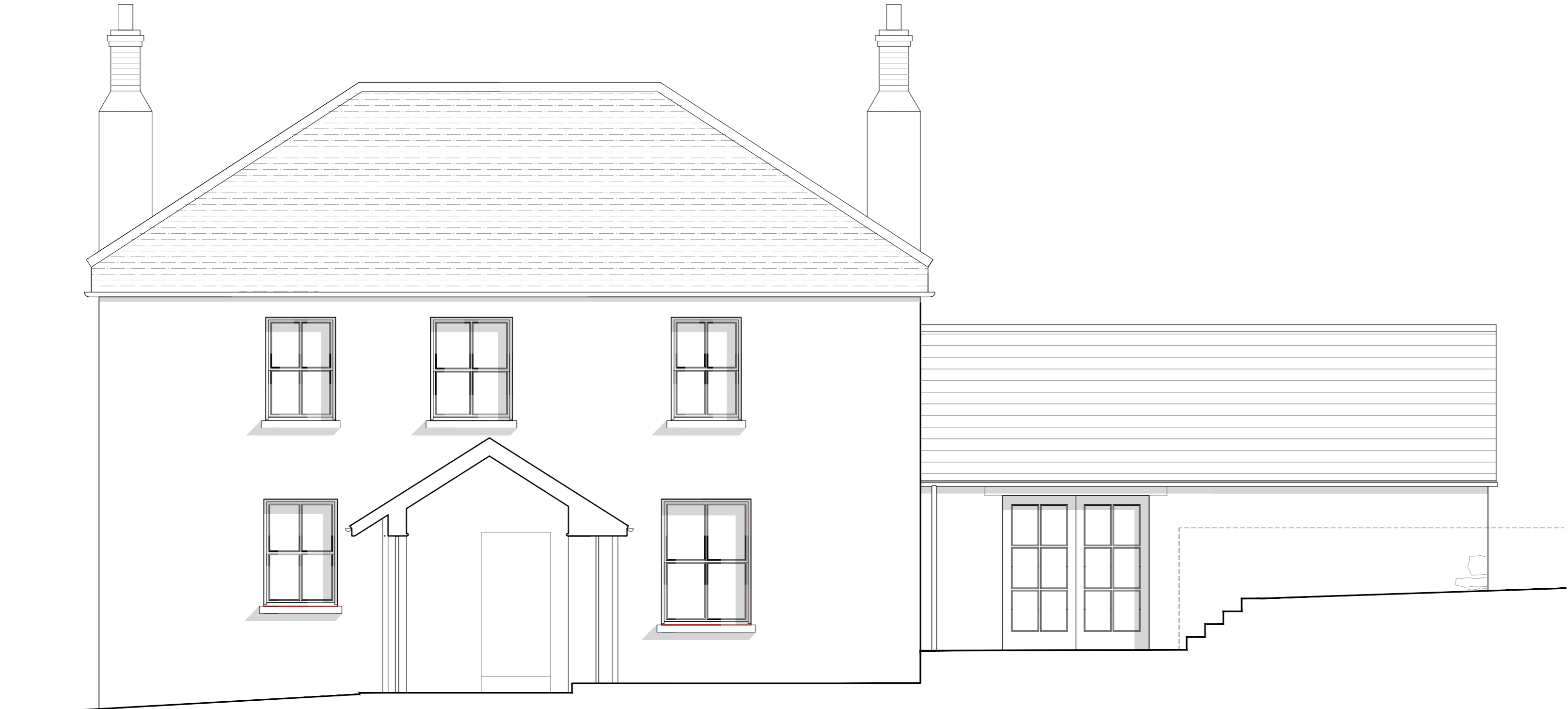
PROPOSED SOUTHWEST ELEVATION