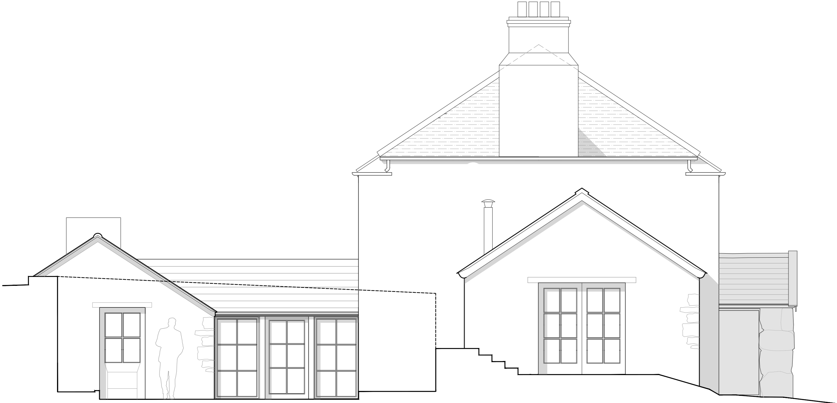
PROPOSED SOUTHEAST ELEVATION