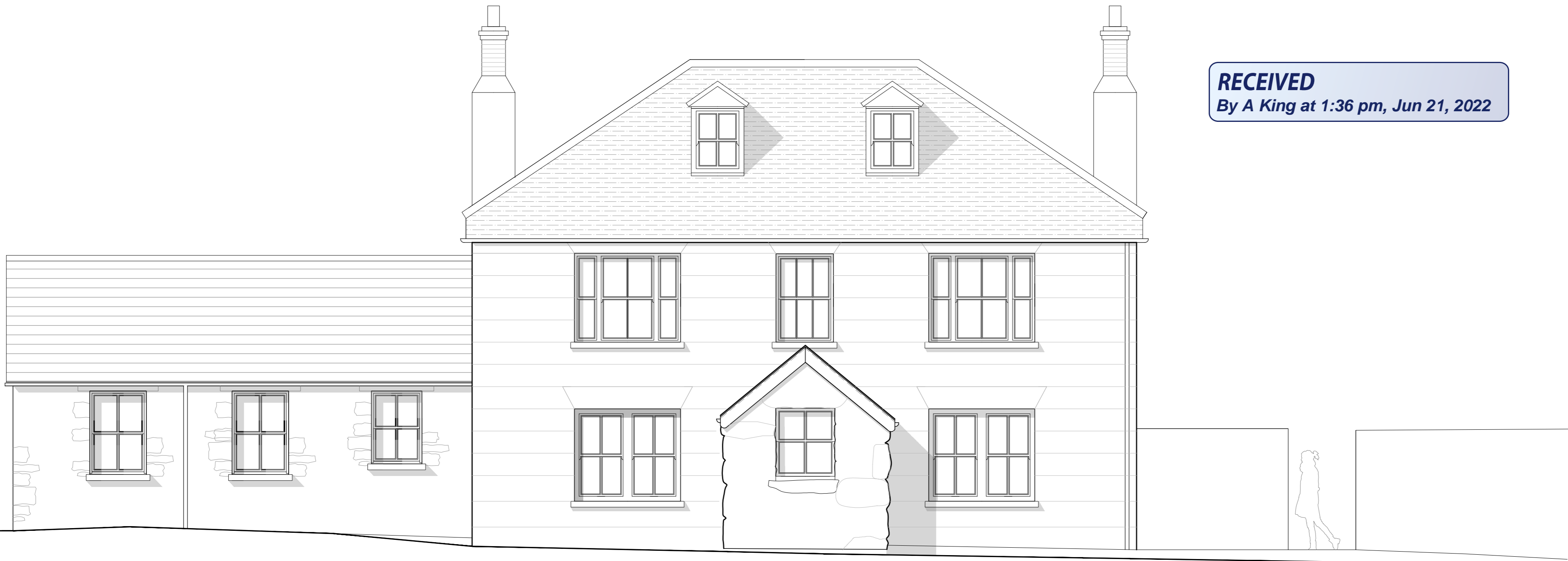
PROPOSED NORTHEAST ELEVATION

RECEIVED By A King at 1:36 pm, Jun 21, 2022