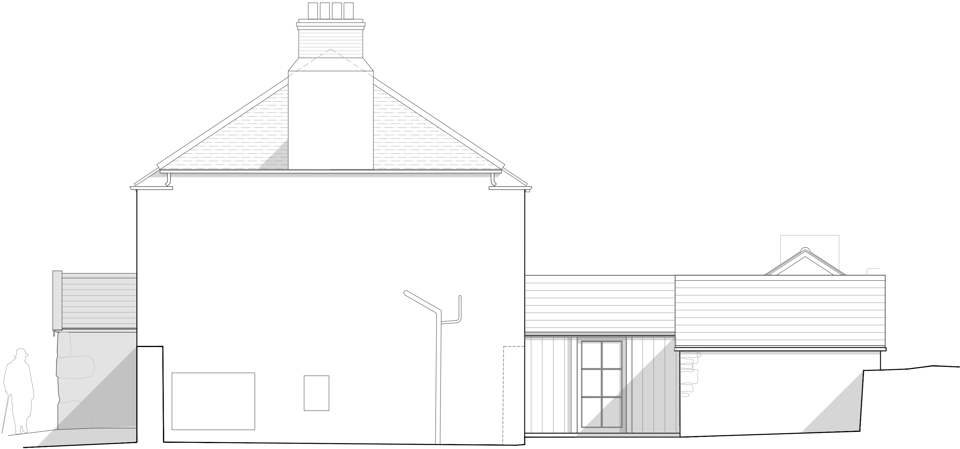
PROPOSED NORTHWEST ELEVATION