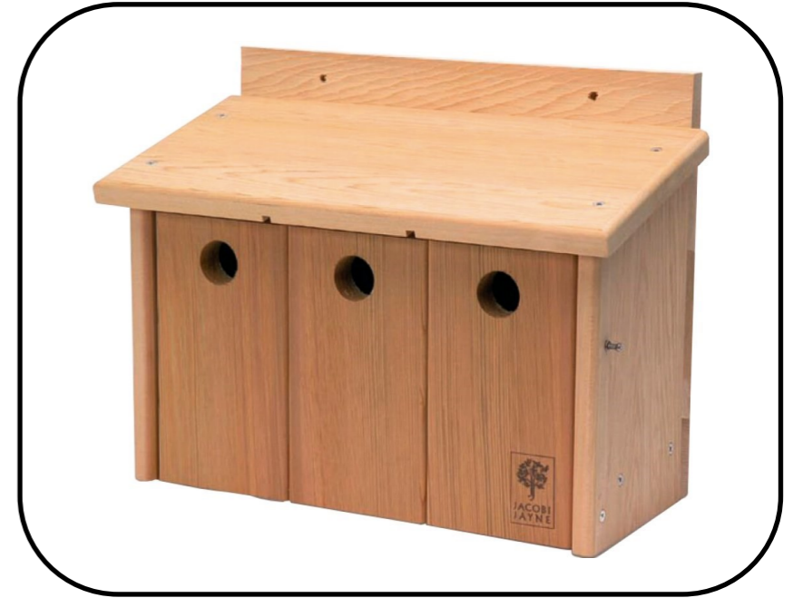
Communal House Sparrow Box