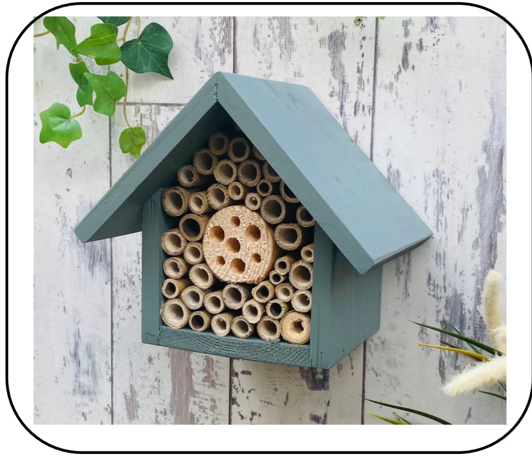
Solitary Bee Box