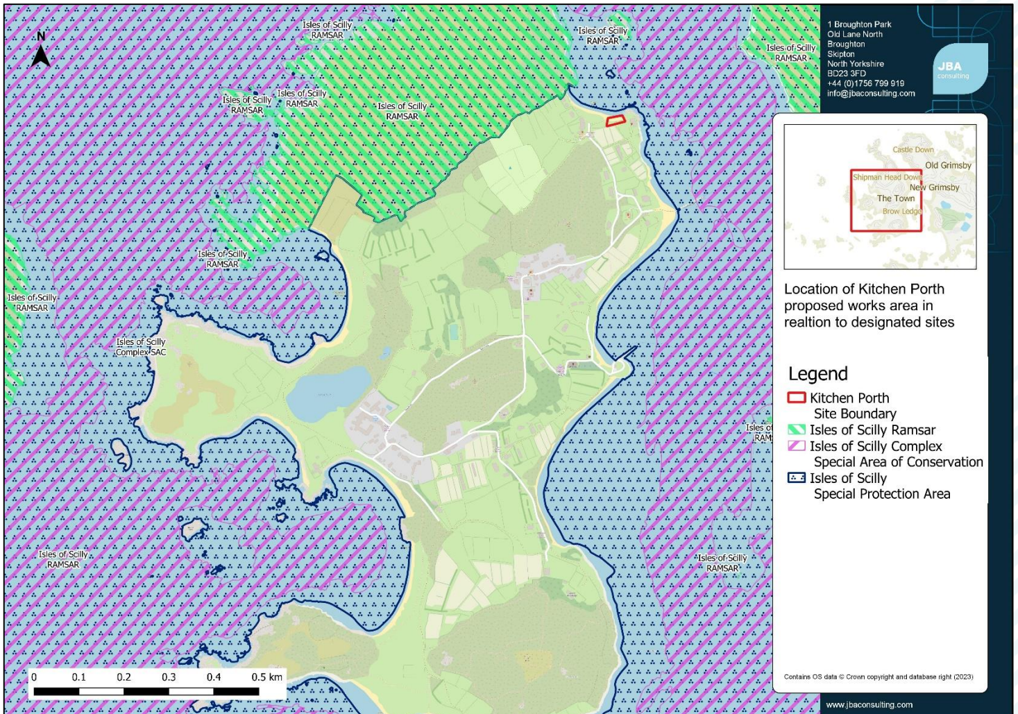
Figure 4-1: Location of Kitchen Porth proposed works area in relation to designated sites; Overview

The proposed scheme is located adjacent to the Isles of Scilly Special Protection Area (SPA), 80m from the Isles of Scilly Complex Special Area of Conservation (SAC) and 120m from the Isles of Scilly Ramsar, as shown in Figures 4-1 and 4-2.