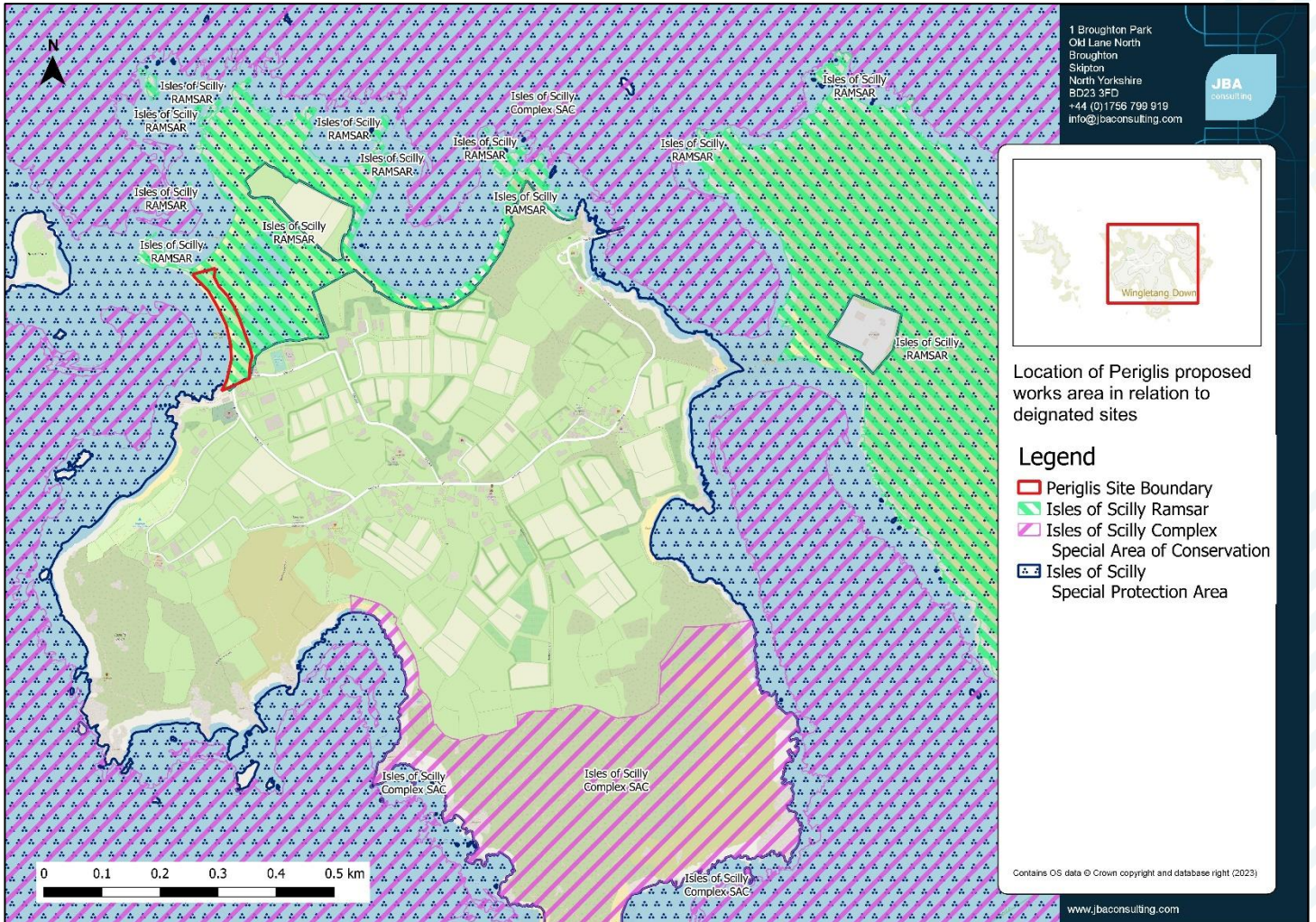
Figure 4-1: Location of Periglis Beach proposed works area in relation to designated sites; Overview

The proposed scheme is located within the Isles of Scilly Special Protection Area (SPA) and Ramsar site and 45m from the Isles of Scilly Complex Special Area of Conservation (SAC).