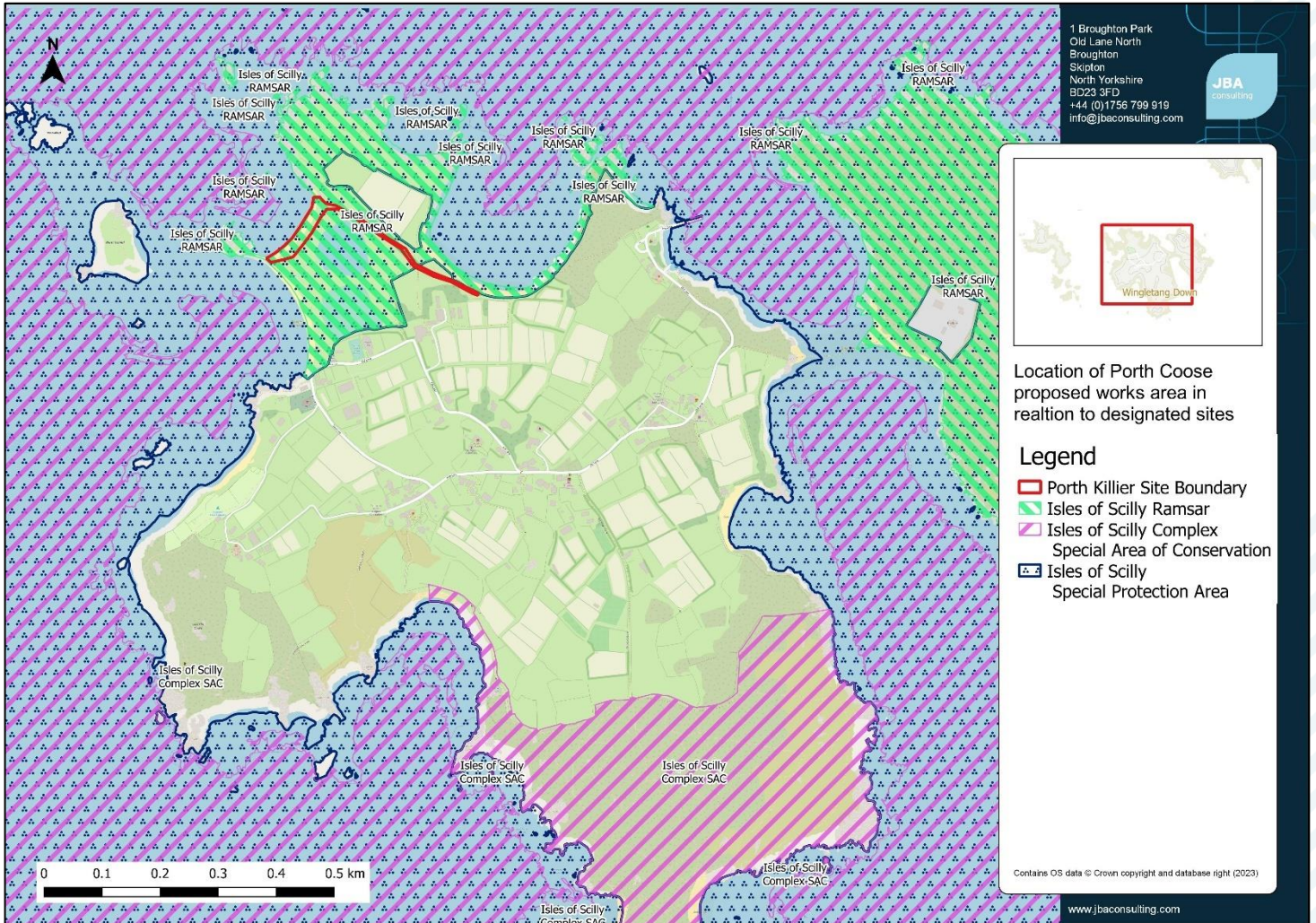
Figure 4-1: Location of Porth Coose proposed works area in relation to designated sites; Overview

The proposed scheme is located within The Isles of Scilly Special Protection Area (SPA) and Ramsar site and 40m from the Isles of Scilly Complex Special Area of Conservation (SAC).