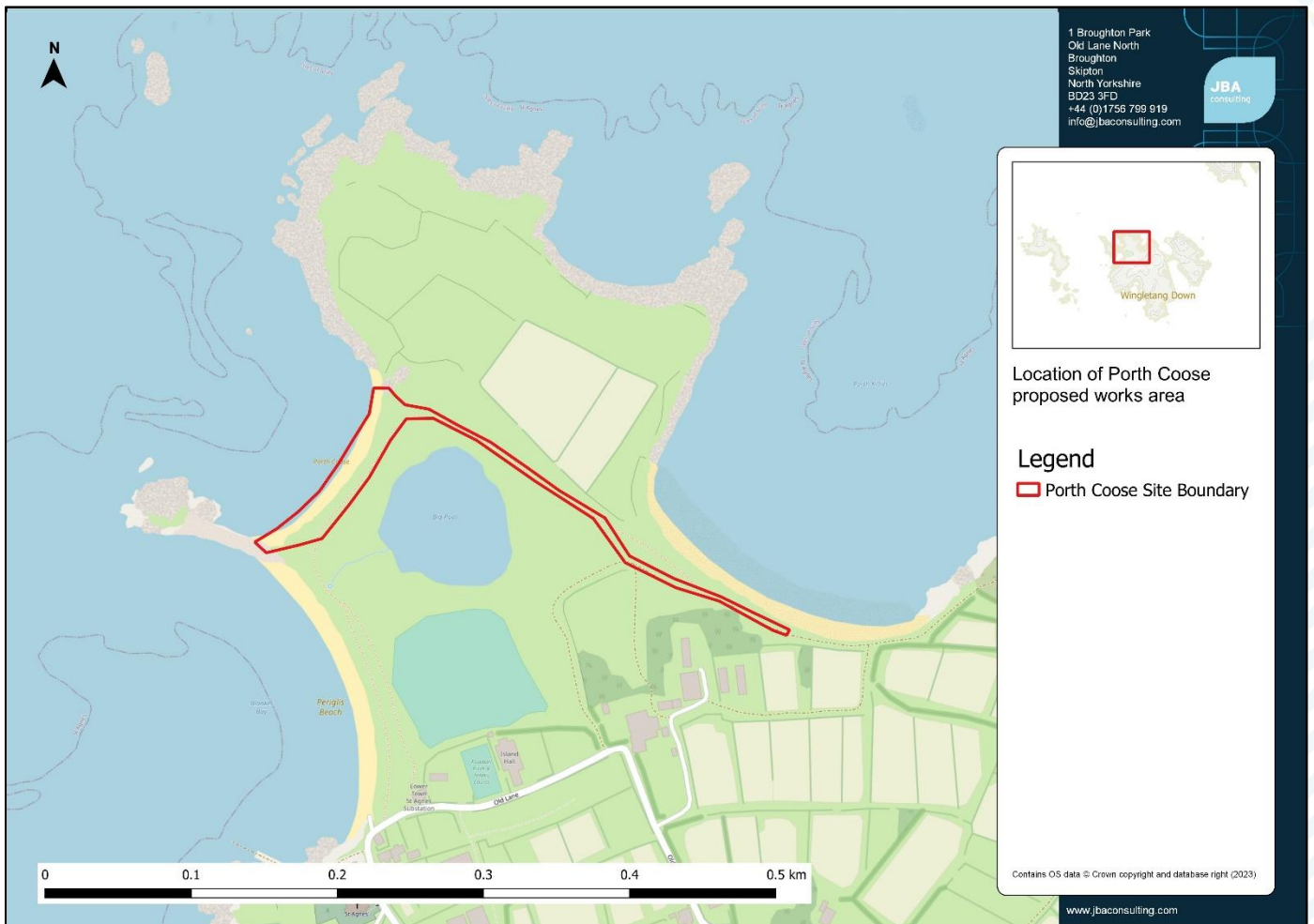
Figure 3-1 Location of the proposed work

Porth Coose is located on the northwest border of St Agnes Island the southernmost populated island in the Scilly Isles. The site extends along approximately 140m of beach on the north west of the island with a central OS Grid Reference of SV 87744 08596. Big Pool SSSI sits behind the site, separated from the beach by low sand dunes, and provides the islands main drinking water supply. The coastline faces north and has areas of weakness where the revetment and erosion matting are exposed and the matting damaged. The displacement of rock armour stone and boulders has led to the exposure of the underlying concrete mattress revetment. The location of the proposed work can be seen in Figure 3-1.